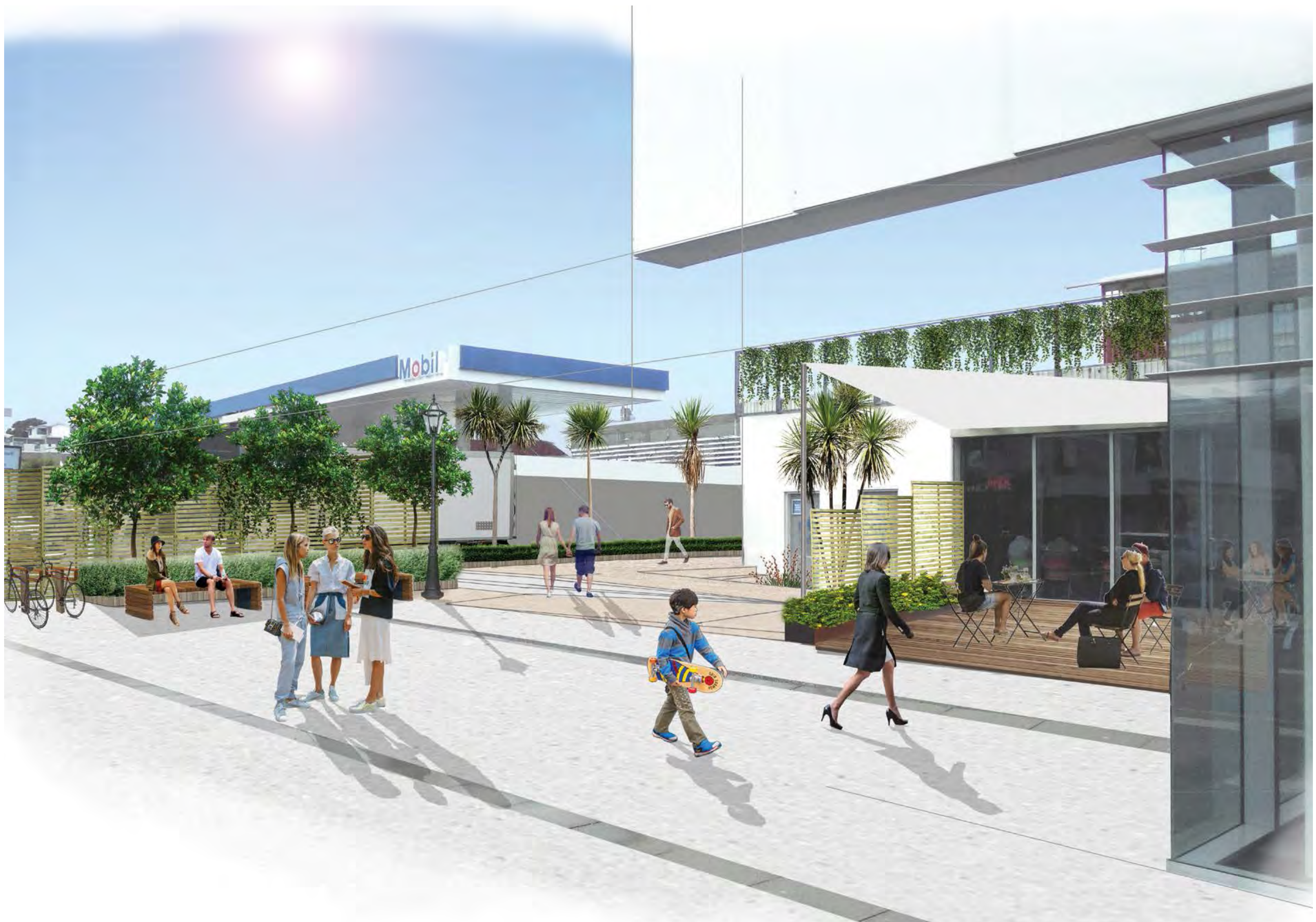
Artist impression: Option B - View from Karori Road into the new Library Square