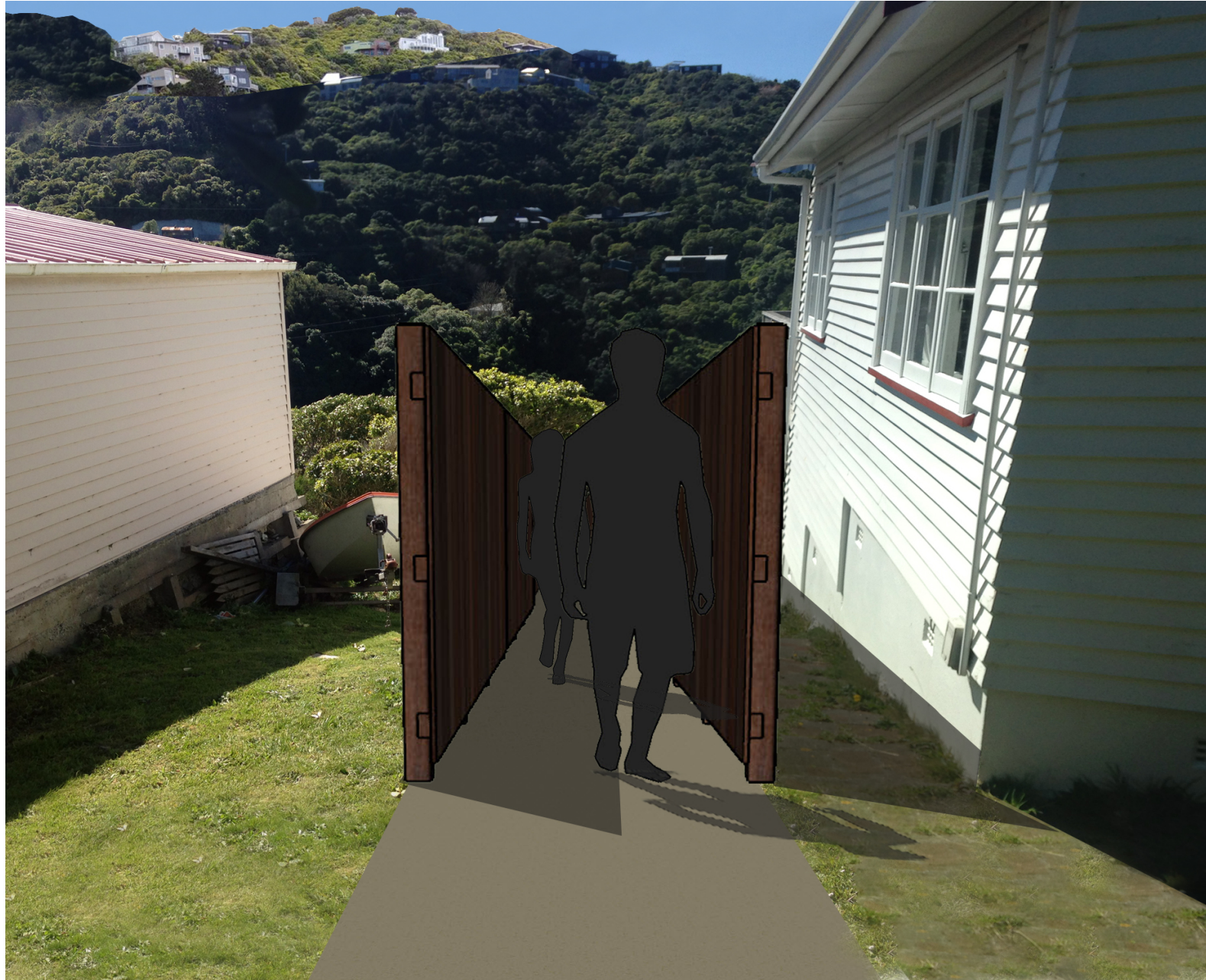
Artist impression only - Fence running down between the property. Fence would extend further back towards the street so is only partially shown as indicative of location and height.

Absolutely Positively Wellington City Council Me Heke Ki Pōneke