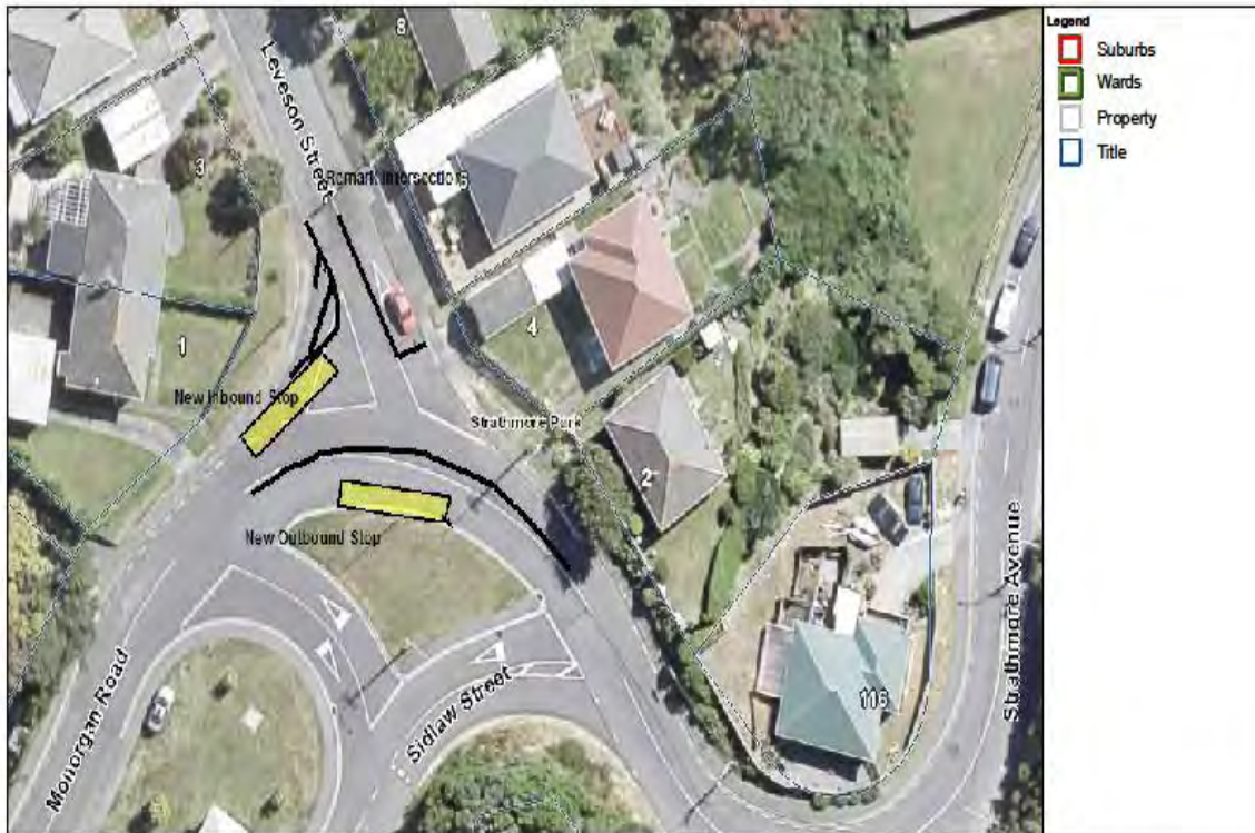
Leveson Street Bus Stops