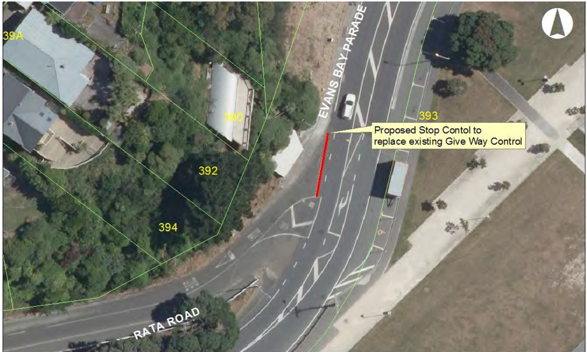
Rata Road, Hatatai TR-148-17 At intersection with Evans Bay Parade Proposed Stop Control Replacing Give Way