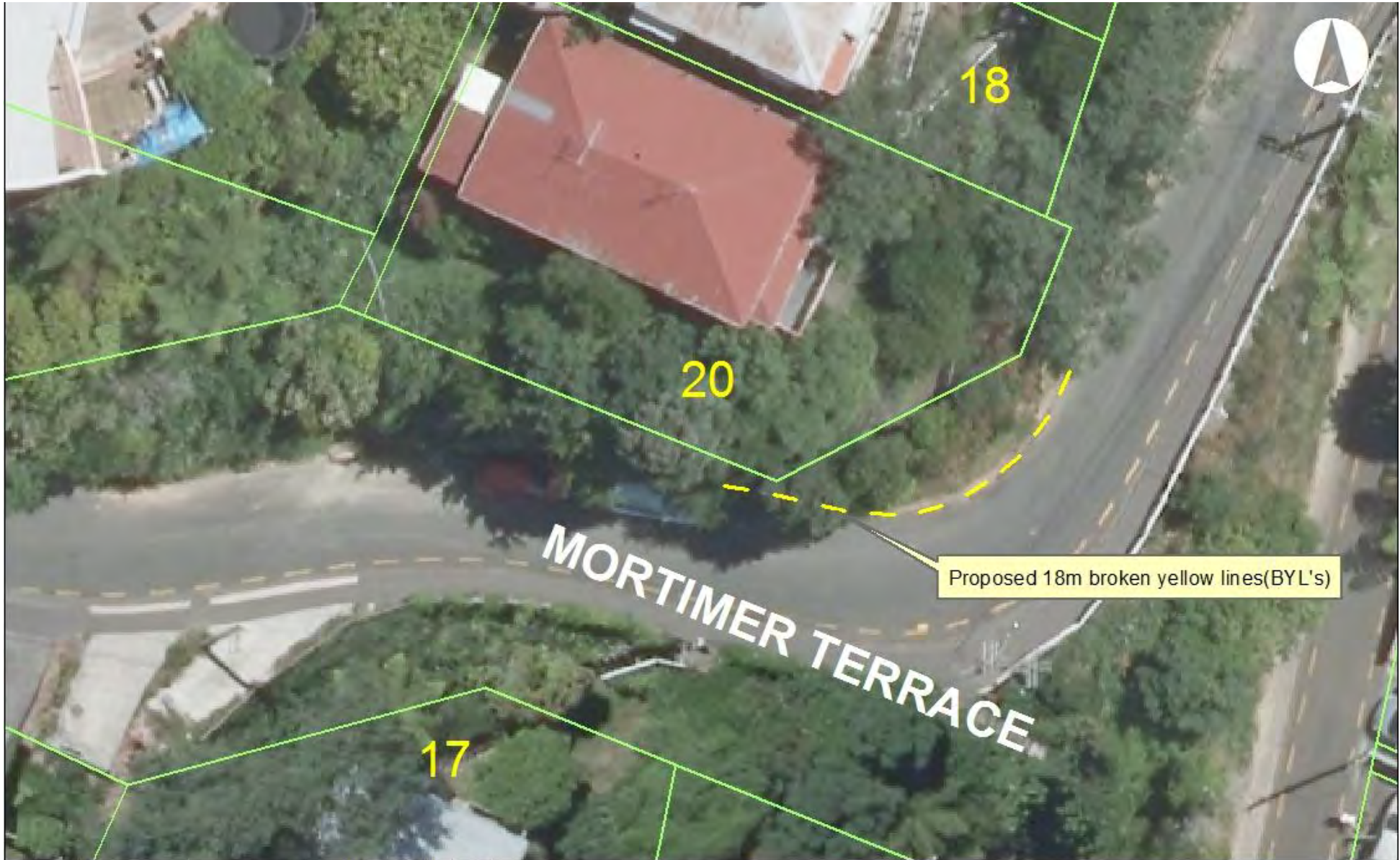
Mortimer Terrace, Brooklyn TR-146-17 No Stopping At All Times