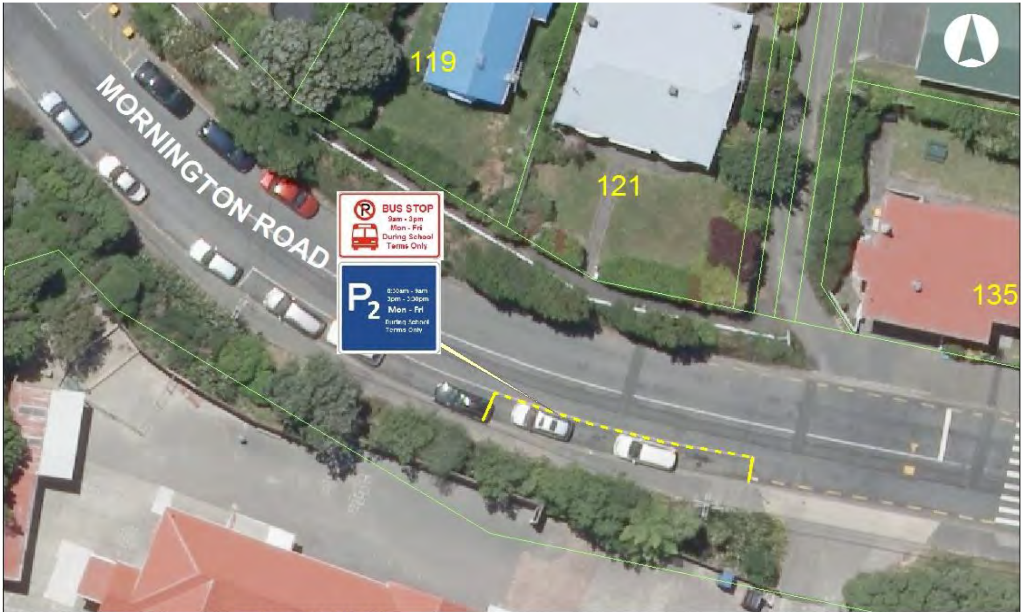
Mornington Road, Brooklyn TR145-17 Outside Ridgeway School Proposed P2, Time Limited Parking