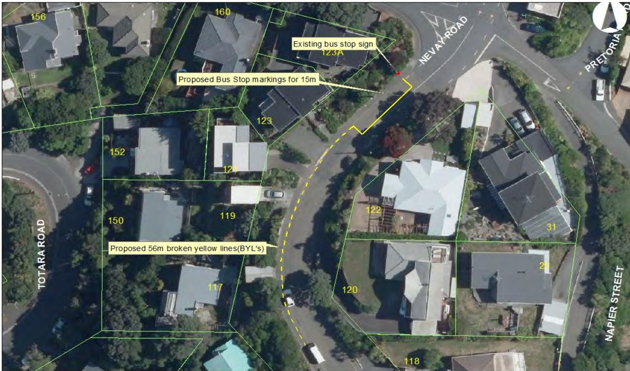
Nevay Road, Karaka Bays -TR-125-17 No Stopping At All Times