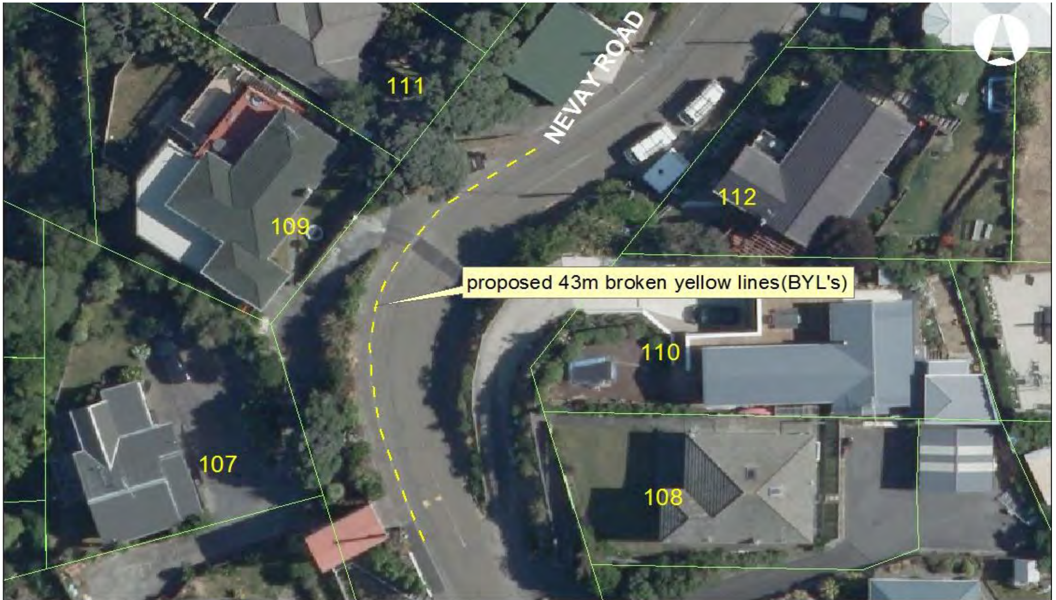
Nevay Road, Karaka Bays -TR-124-17 No Stopping At All Times