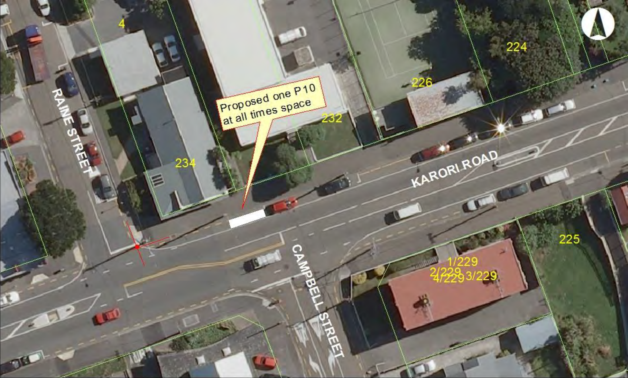
Karori Rd -Karori - TR(23 - 17) Proposed P10 At All Times Os Subway