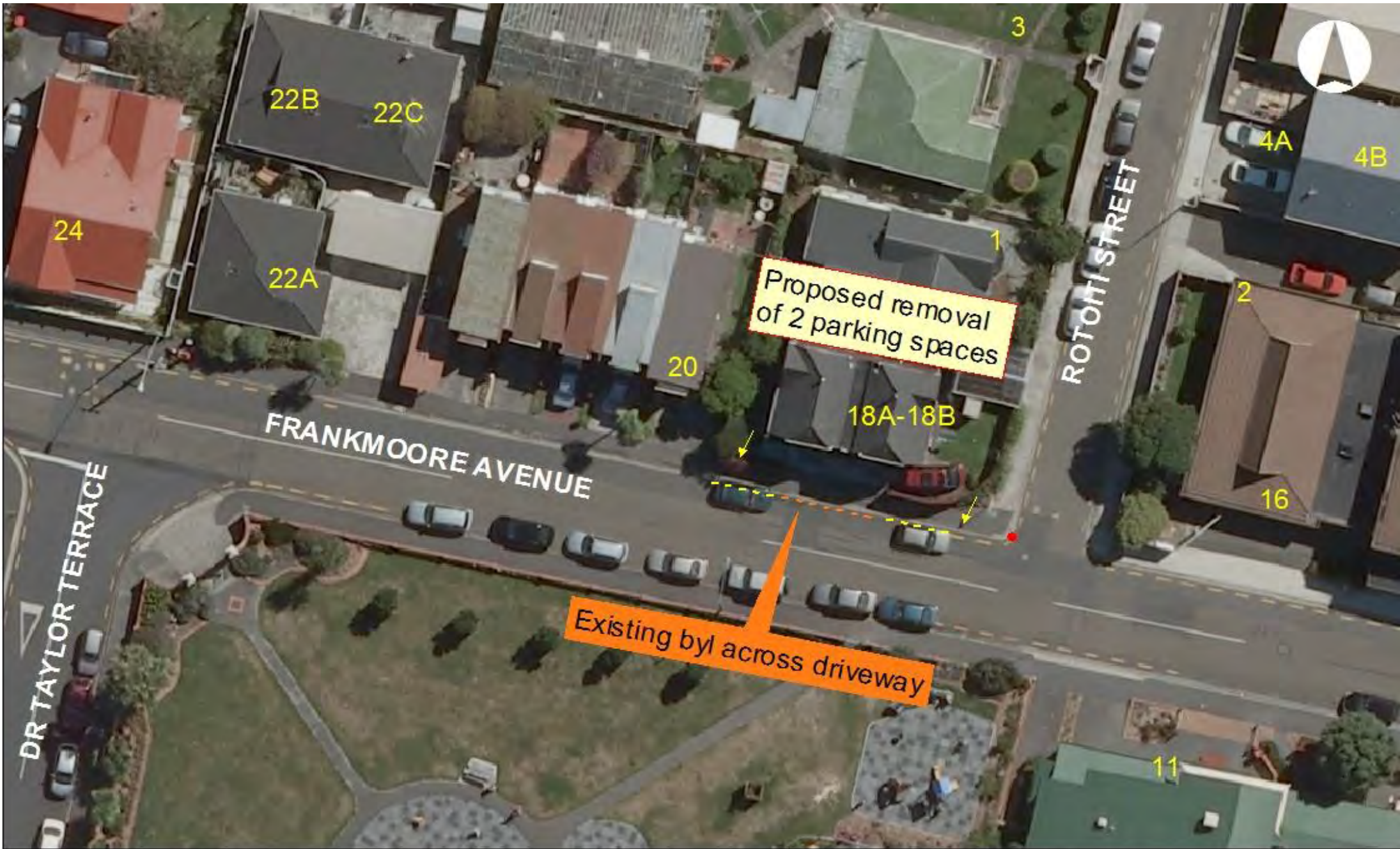
Frankmoore Ave - Johnsonville - TR (3 - 16) Proposed NSAAT - OS #18A & 18B