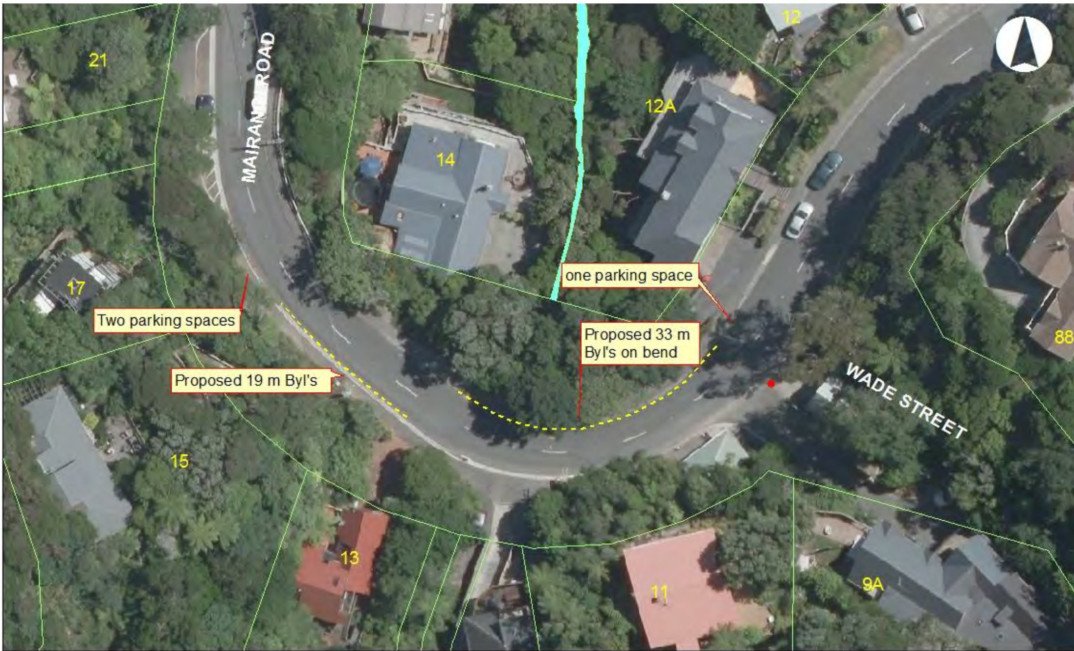
Mairangi Rd - Wadestown - TR (2 - 16) Proposed NSAAT Restriction