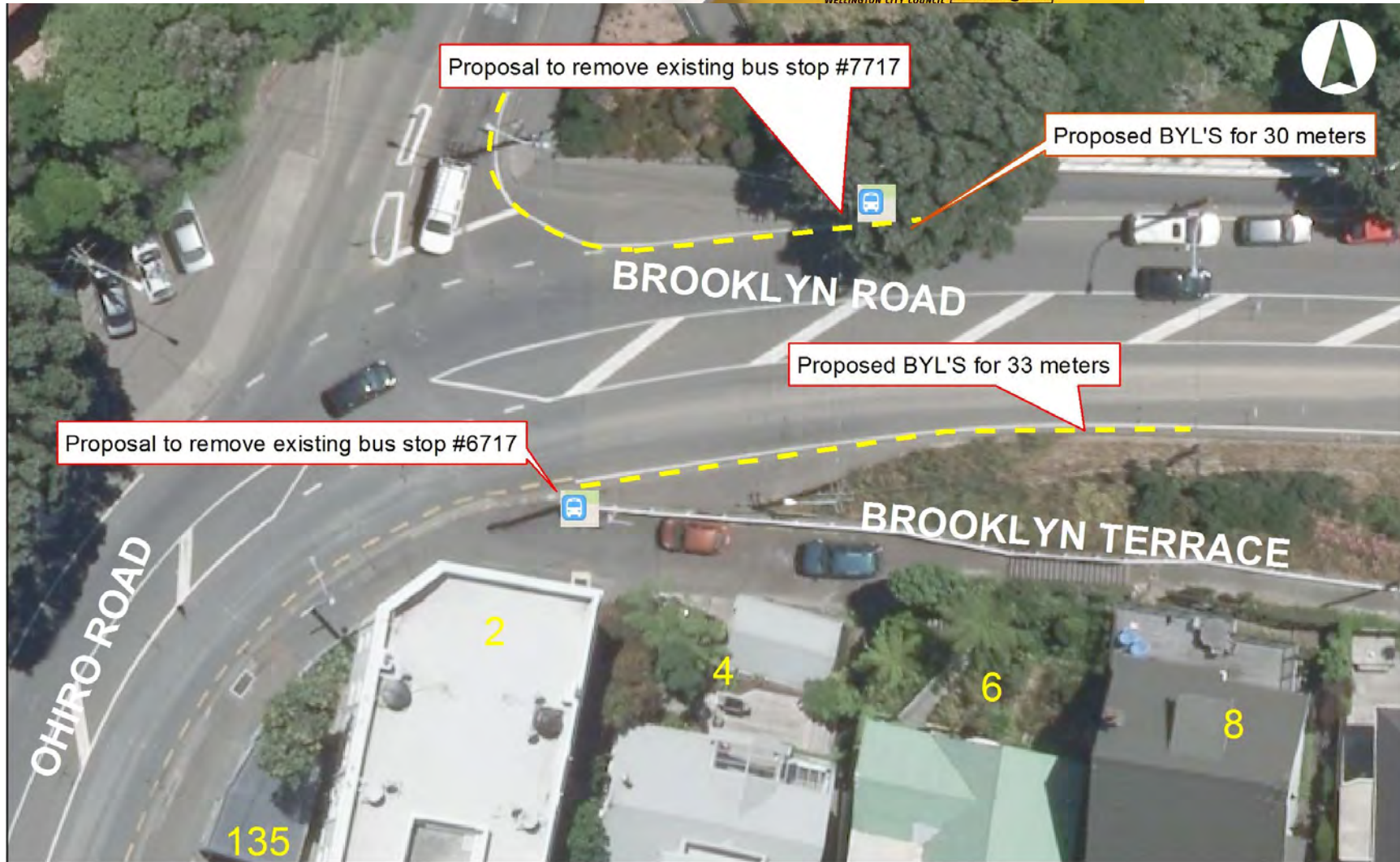
Brooklyn Road, Brooklyn Proposed Traffic Resolution (TR59-14)