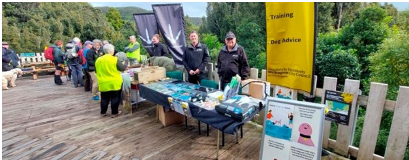
A pop-up education activation, in collaboration with Capital Kiwi.

We are committed to running more of these courses in the future as they prove to be very popular, and we receive excellent feedback from those that attend.