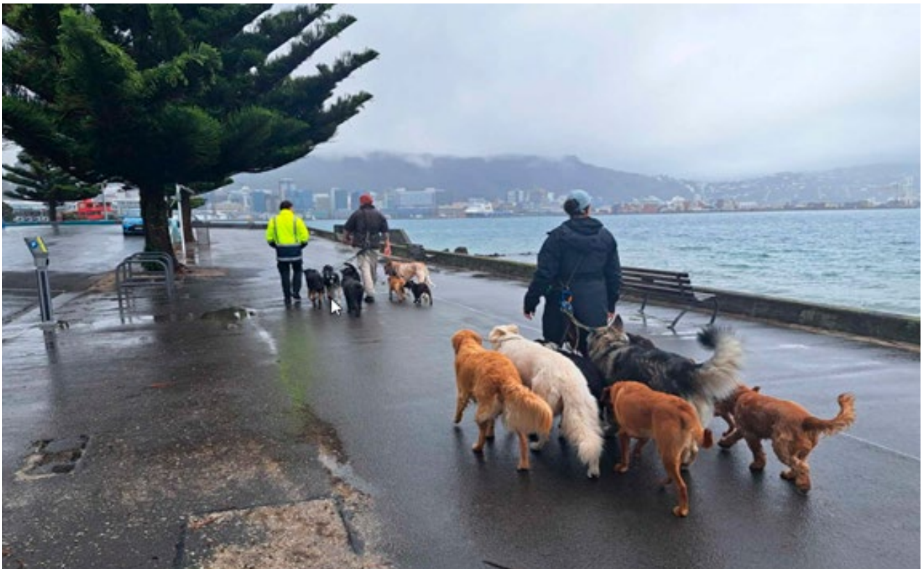
An assessment taking place in Wellington.