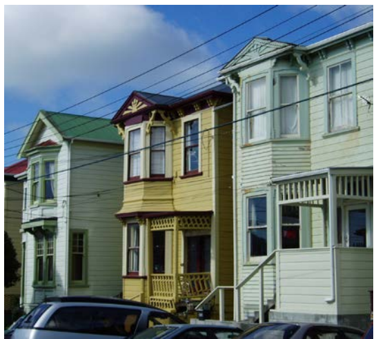
The Area is a highly intact remnant of residential housing from the first decade of the 20<sup>th</sup> century

The general intactness of the area's urban fabric is largely due to the relatively limited number of new developments. New development occurs primarily in the form of multi-storey apartment blocks, typical around Riddiford Street, Adelaide Road and Daniell Street, and townhouses with a more variable location.