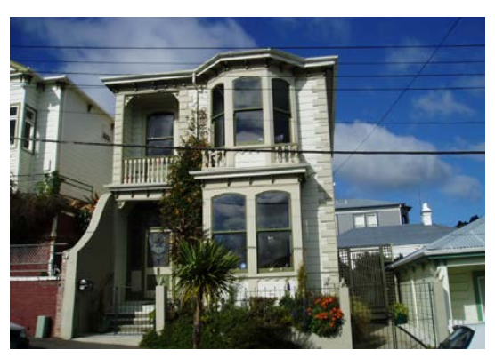
Entrances and main windows addressing the street