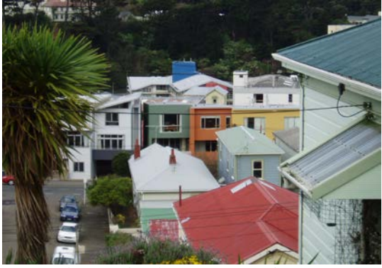
New multi-unit development around Tasman Street