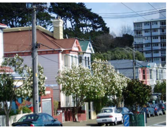
Distinctive local character with a strong sense of place

At the same time, the area exhibits a sense of visual diversity. This is derived from variations in roof form and building height, often accentuated by topographical variation and further enhanced by the presence of non-residential building types.