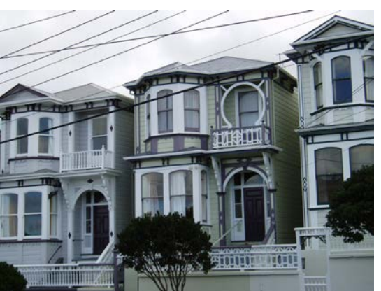
Wright Street - a notable concentration of original dwellings