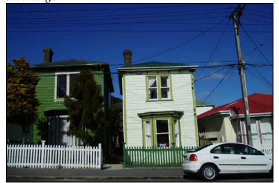
Common building dimensions