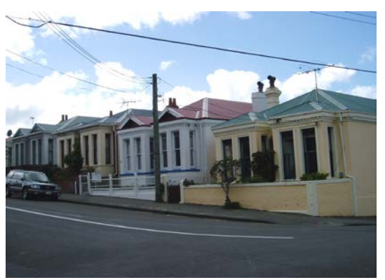
Consistency of building type and scale - notable grouping of semi-detached brick dwellings at the southern end of Rintoul Street