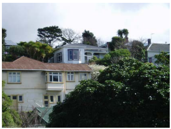
Akatea Street - strong streetscape presence accentuated with prominent mature vegetation