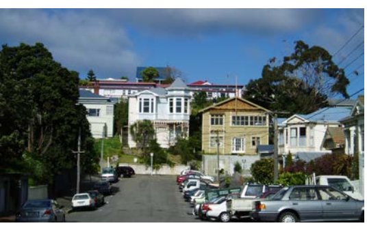
Manley Tce - an exceptionally wide cu-de-sac with a strong sense of place