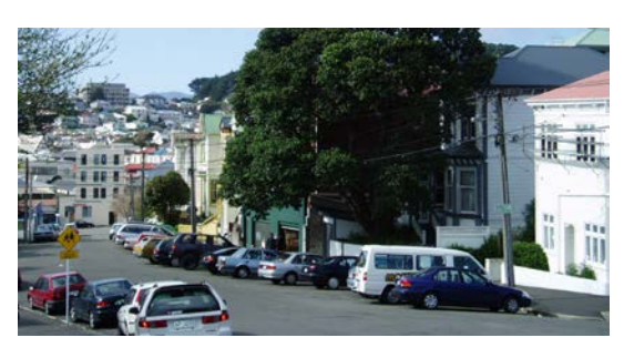
Carparking is typically on the street

Most of the existing garages are found along the higher side of streets. Garages on steep frontages, typically built into the slope and located in front of and below the dwelling, have a lesser impact on the streetscape than free-standing garages.