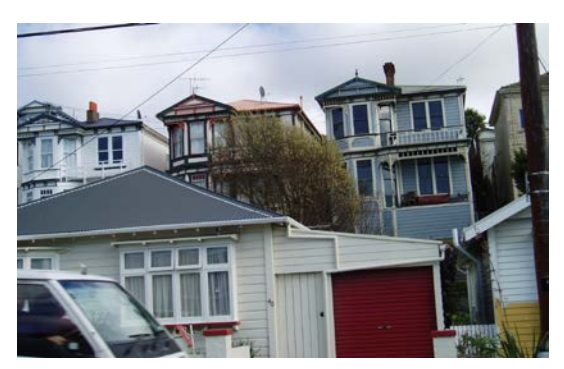
Kenwyn Tce - a notable concentration of original dwellings viewed from Rintoul Street