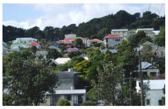
High intensity development is typically compensated for by mid-block open space with mature vegetation

Variation of front yard dimensions usually relates to variation of topography. Dwellings on sites sloping steeply up from the street typically have deeper frontage setback than those on flat or downward sloping sites.