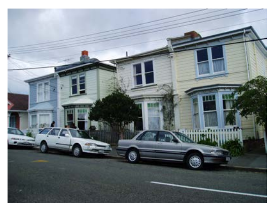
Consistency of character and a high degree of visual unity