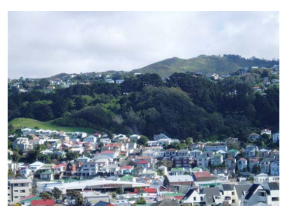
Visual diversity derived from variations in roof form, building height and topography.