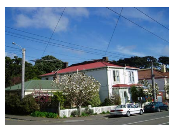
Limited range of building types

The area contains a relatively small number of multi-storey apartment blocks and town house developments of variable scale and layout. Most of the multi-unit development is located along or close to major streets and/or on larger or former industrial sites.