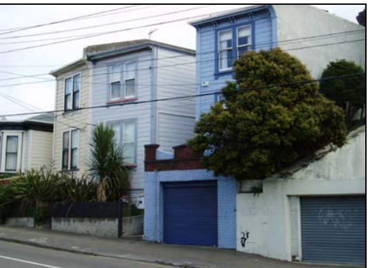
Defined street edge with buildings typically aligned with the street grid