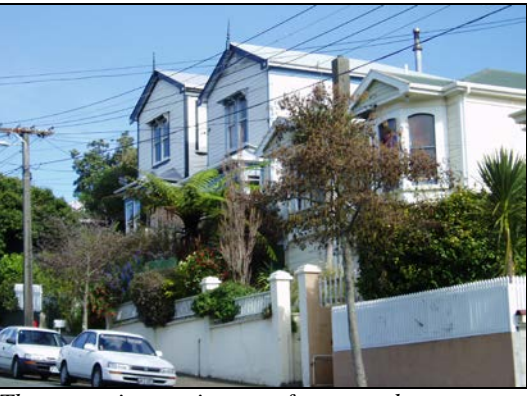
The area is a mixture of one and two storey dwellings

Site coverage - the area as a whole is characterised by