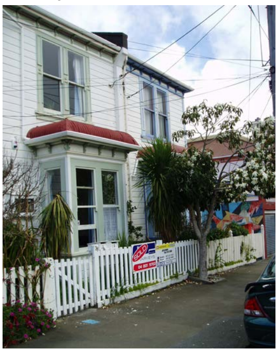
Neighbouring buildings, aligned with each other give a strong street edge definition