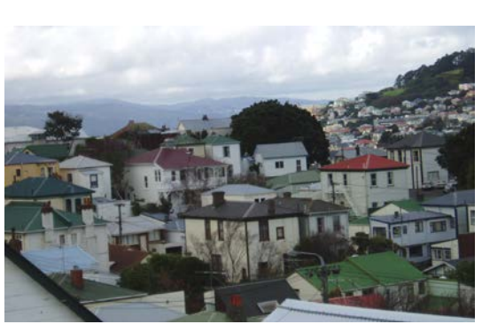
Intricate roofscape demonstrating consistency of roof type and pitch

Rear elevations were traditionally shaped by service requirements for the household, often with a poor relationship existing between the house and the garden. Opportunities have been taken to redevelop the rear elevations to open to the gardens, especially where there is a northerly aspect or view.