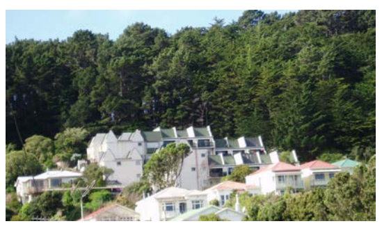
Mixture of original dwellings and multi-unit development