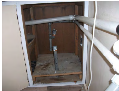
P & D 05 – Remains of gas meter installation within apartment kitchen