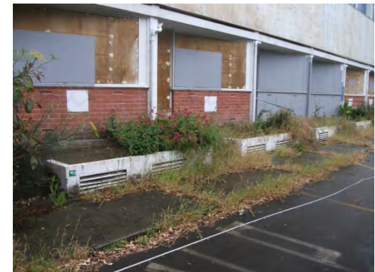
P & D 12 – East side stormwater at ground level.