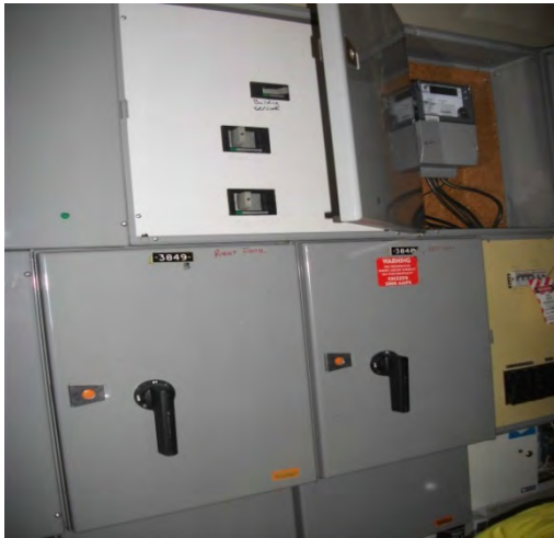
E 01 – Main Switchboard feeder cables into 2 separate switches