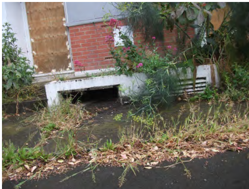
VENTIATION 10 – Subfloor ventilation openings