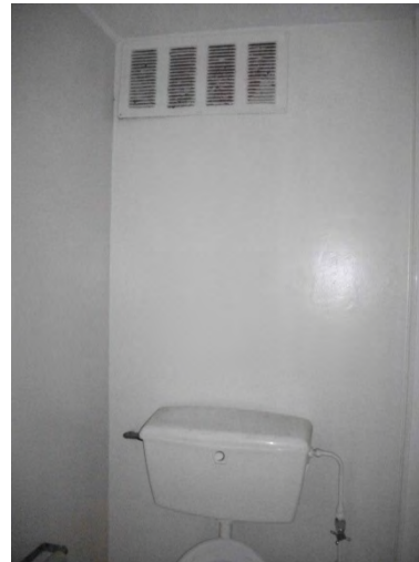
VENTIATION 02 – Extract grille within apartment bathroom