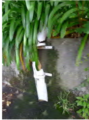
CV 02 – Broken PVC Stormwater pipe