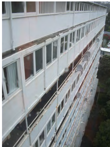
P & D 10 – West side storm water drainage