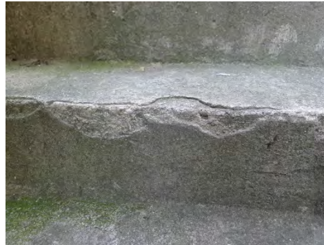
CV 08 – Spalling on steps