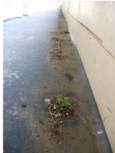
P & D08 – Apartment common area walkway drainage