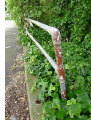
CV 09 – Broken handrails