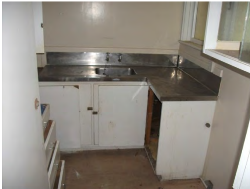
P&D 04 – Typical apartment kitchen