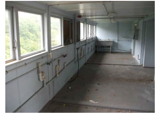
P & D 09 – Typical roof level laundry