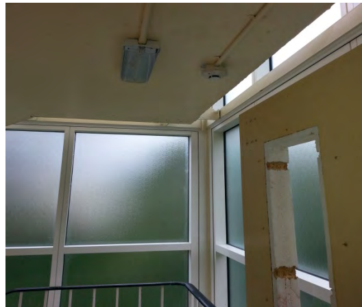
VENTIATION 11 – Typical stair windows