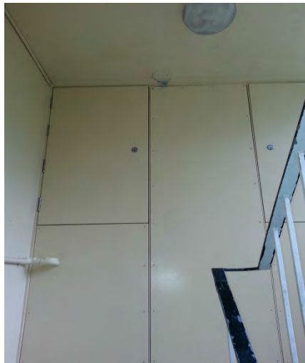
E 04 – Typical floor DB in escape stairwell with fire/smoke rated doors