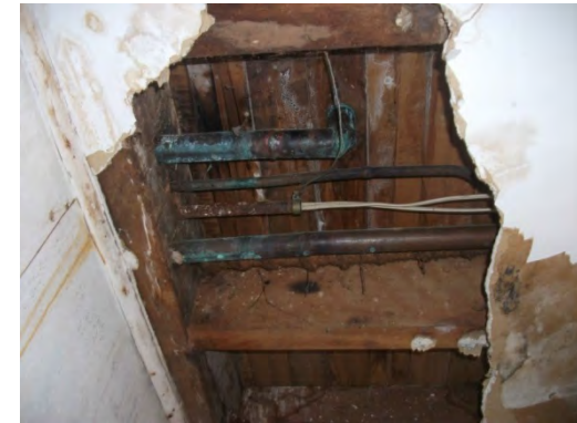
P & D 06 – Pipework in apartment mezzanine floor void