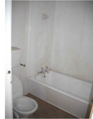
P&D 03 – Typical apartment bathroom