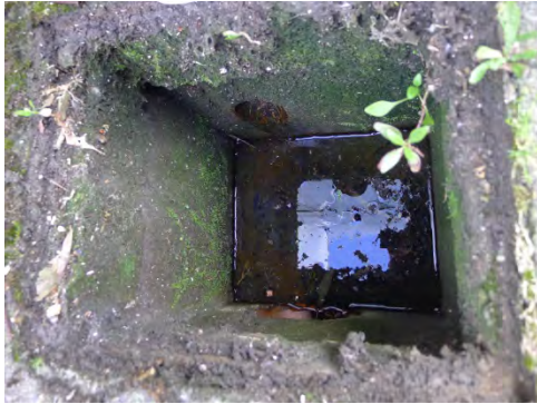
CV 01 – Poorly maintained Stormwater Sump