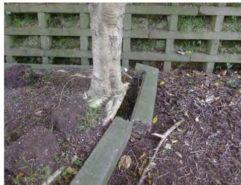
CV 05 Broken kerbs