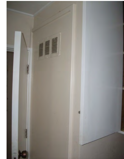
VENTIATION 03 – Extract grille within apartment kitchen