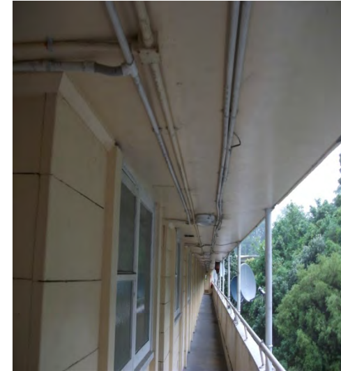
C 03 – Typical corridor power & communications reticulation to apartments