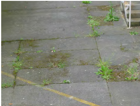
CV 04 - Uneven concrete pavement