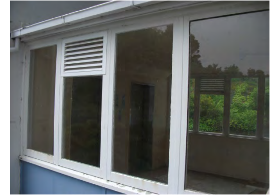
VENTIATION 09 – Typical lift lobby ventilation louvers