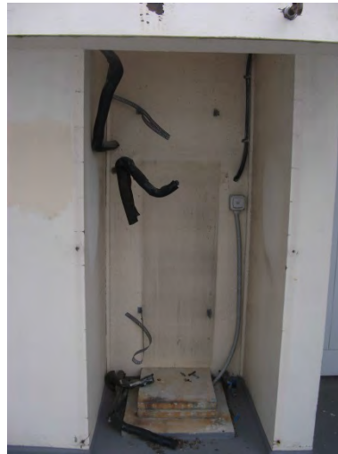
P & D 14 – Remains of laundry central gas HWC installation