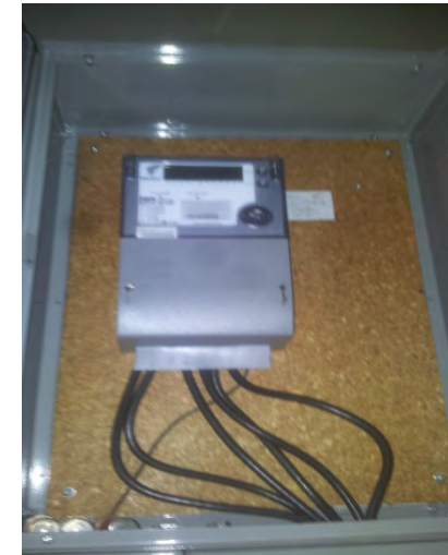
E 03 – Existing new Revenue Meter