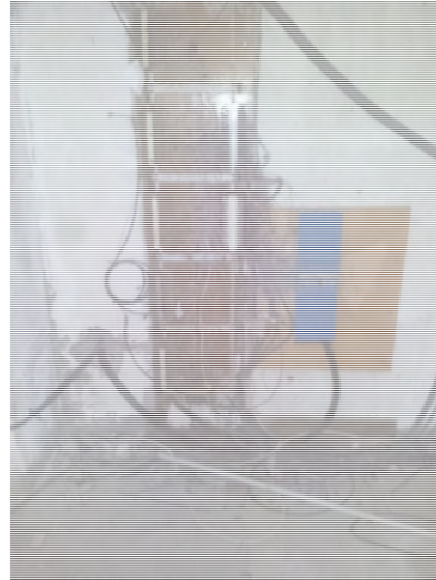
C 02 – Main Communications riser in north stair services shaft