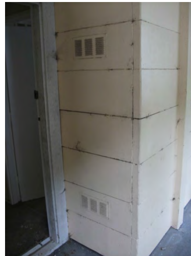
VENTIATION 05 –Existing façade ventilation grilles into apartment kitchen (old food safe)