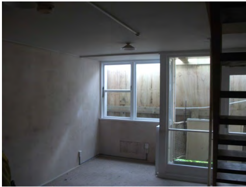
VENTIATION 01- Typical opening window within apartments