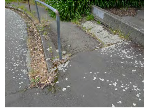
CV 03 Uneven asphaltic pavement