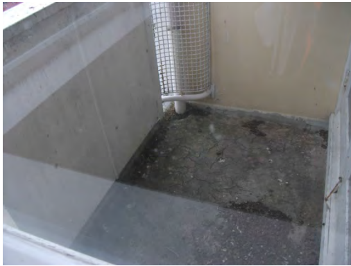
P & D 07 – Drainage from apartment east side balcony