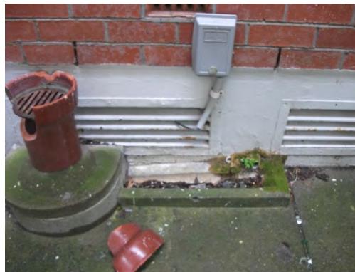
P & D 11 – West side gully trap and drainage channel