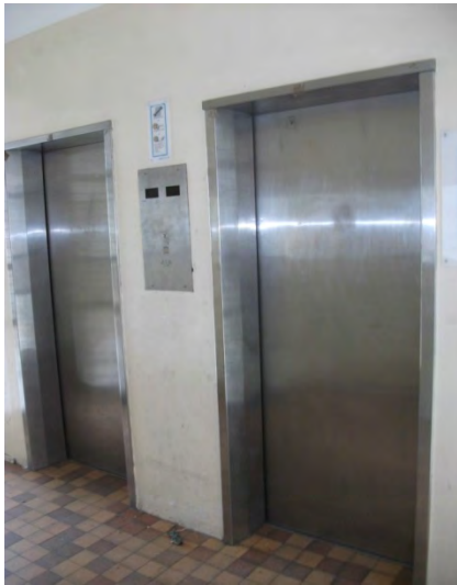
VT 01 – Typical lift landing station