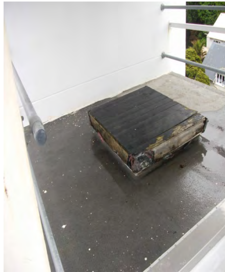
VT 02 Hatch in roof for access to LMR stair-