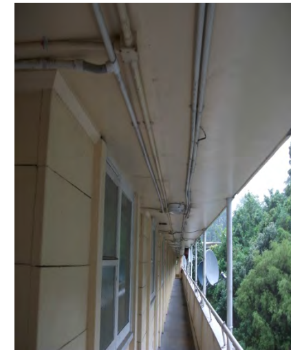
E 06 – Typical power & communications distribution to apartments