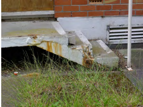
CV 07 – Degraded steps