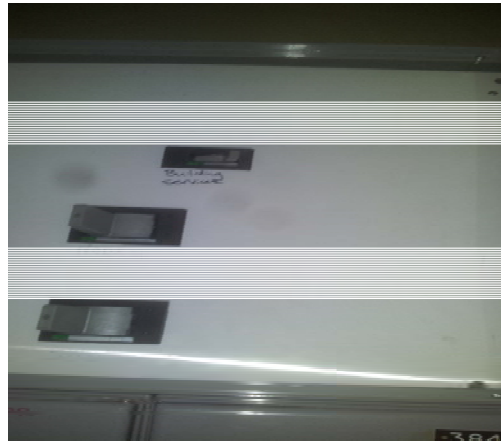
E 02 – MSB with feeds to North, South and Roof /Lift loads