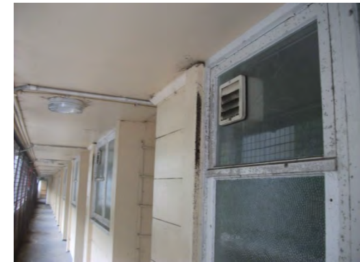
VENTIATION 06 -Typical retrofitted window mounted kitchen extract fan