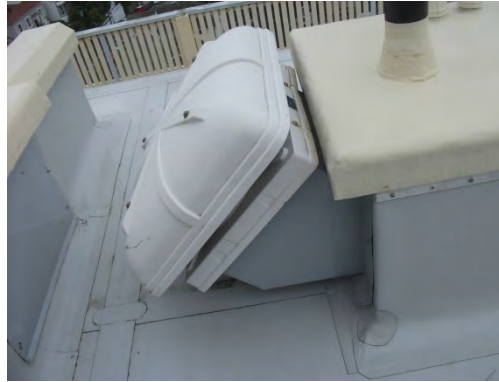
VENTIATION 08 – Typical extract riser ventilation fan installation.