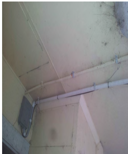
C 04 – Typical communications connection above entry door to apartment