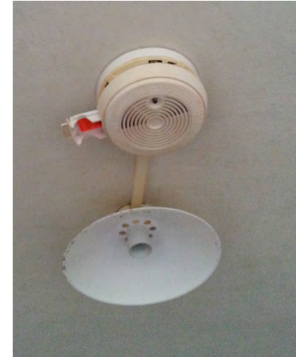
FS 03 – Smoke detectors within residential units