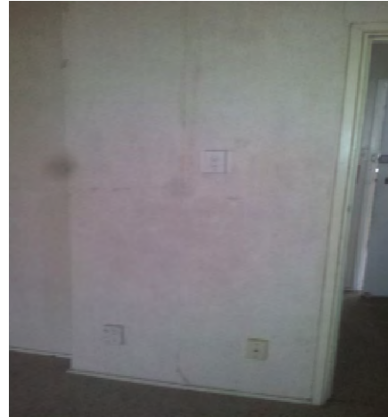
E 08 – Typical power & communications outlets with wiring concealed behind wall linings.