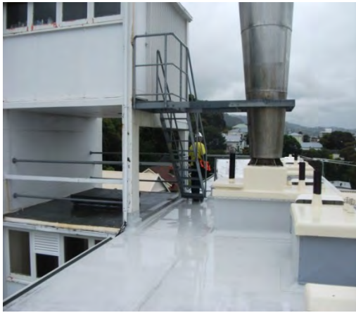
P & D 13 – Typical drainage vents at roof level