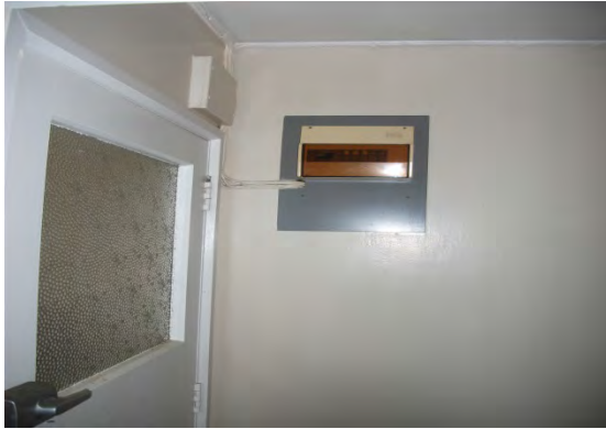
E 07 – Electrical Switchboard behind apartment entry door