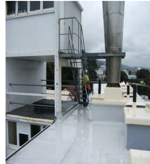
VT 03 – Stair to LMR