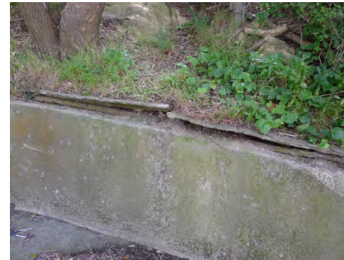
CV 06 Damaged retaining walls