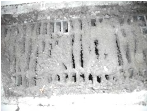
VENTIATION 04 – Condition of intumescent fire damper behind apartment bathroom extract grille