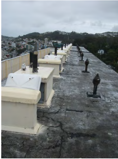
VENTIATION 07 – Roof mounted extract fans along roof