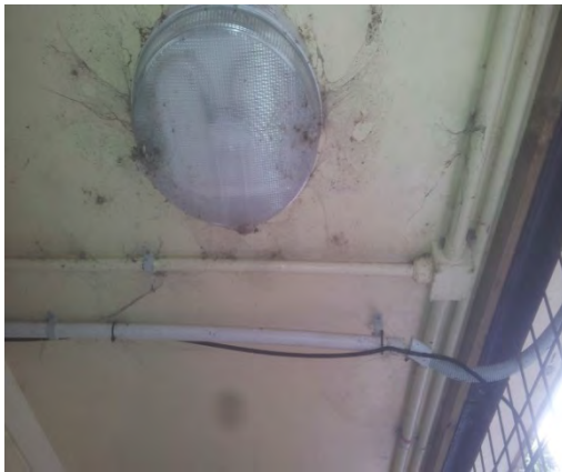
E 10 – Typical apartment external corridor lighting