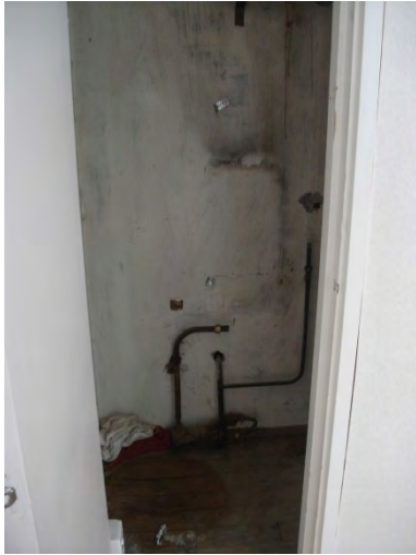
P&D 01 – Remains of apartment domestic hot water system