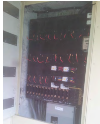
E 05 – Typical floor distribution board with refurbished tap off main switch, Apartment meter positions with fused protection and PYRO sub-main feeders