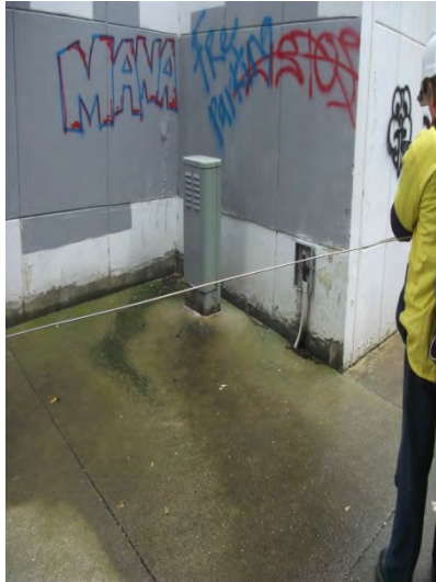
C 01 – Communications services connection