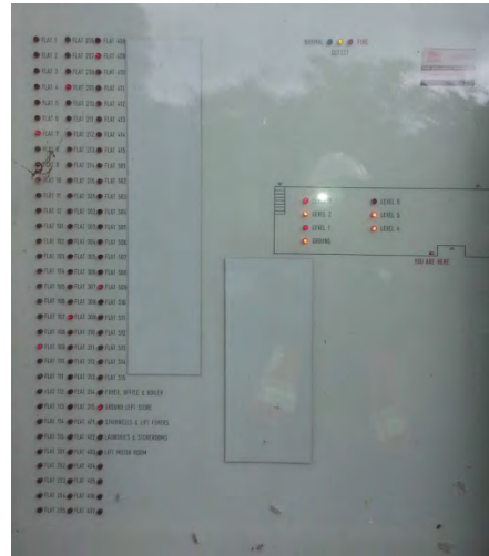
FS 02 - Fire alarm mimic panel, indicating various alarm/defect conditions