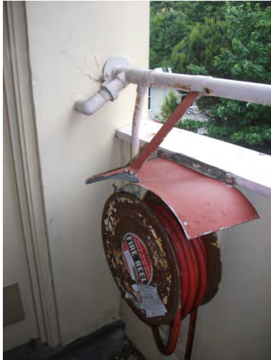
FS 01 – Highly corroded mild steel hose reel assembly, located within the balcony.