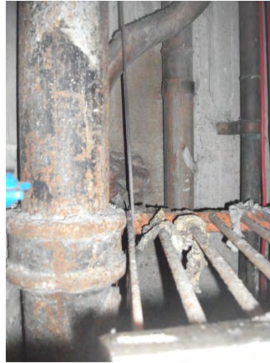
P&D 02 – Pipework in riser