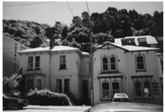
Original pre 1920's dwelling

This area extends south from Harriet Street as far as Patanga Crescent. It is bordered by the Town Belt to the west, and Thorndon Character Area to the east. In general the building character within Tinakori Road South relates to the building character in the Thorndon Character Area. The dominant distant view of this more steeply sloped area is of a highly variable arrangement of buildings on the hillside with planting visible between the buildings.