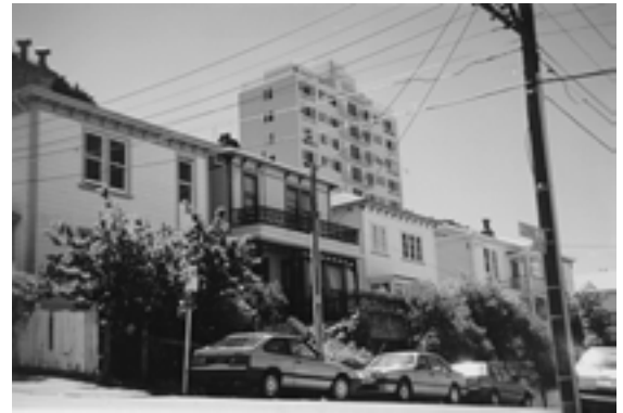
The hipped roof villa is the predominant building type along Goring Street