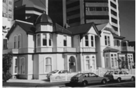
Portland Crescent – clearly defined front elevations with bay windows, entries and verandahs facing the street.