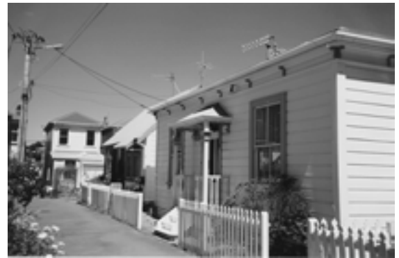
Narrow street width