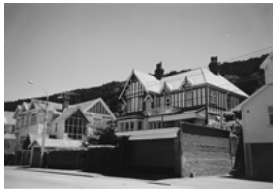
The northern end of Tinakori Road is characterised by large dwellings