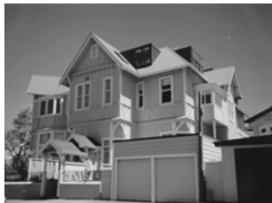
Residential building of “grand scale” are typical in Hobson Street