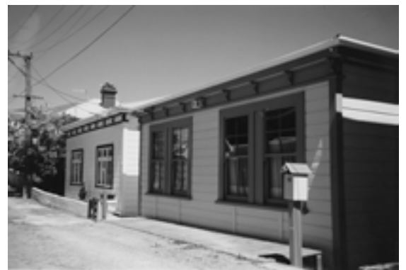
Single story dwellings built prior to 1920