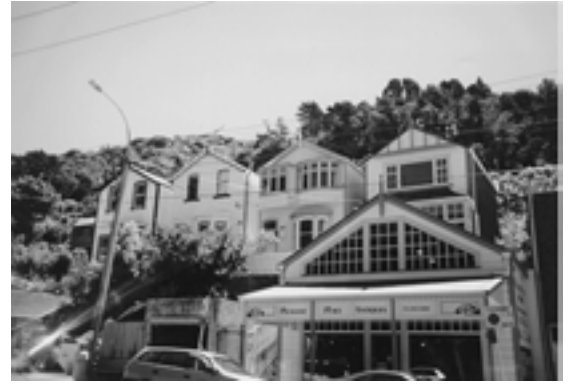
Strong sense of aesthetic coherence

Thorndon is based around the street grid aligned with Tinakori Road and a second grid aligned with Hobson Street. Thorndon has a particularly distinctive pattern of high density urban fabric of original dwellings consistently aligned with the geometry of the underlying street grid and integrated by a strong sense of aesthetic coherence.