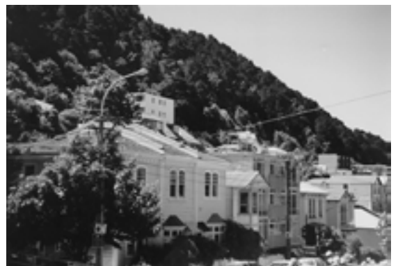
Diversity of building types and forms