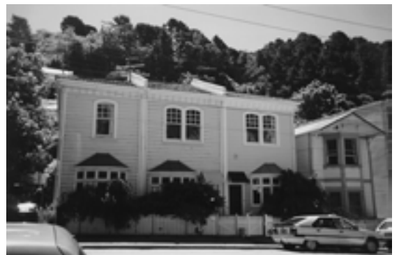
Dispersed groupings of consistent type form and character