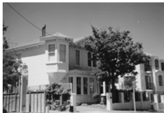
Variety of forms and details