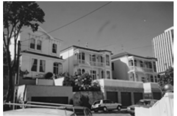
Western side of Portland Crescent – larger set backs and garages built to the street boundary