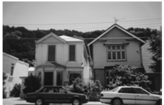
Clearly defined front elevations