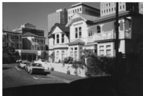
Portland Terrace – notable concentration of two story villas