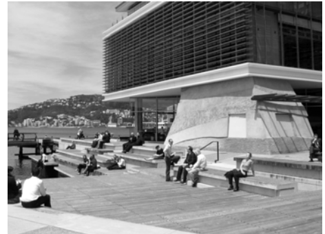
Public space on active frontage

(Nk) G6.6 Orient all buildings so that they present active frontages and shelter to adjacent public spaces. Ensure the upper levels of buildings show signs of inhabitation and contain openings.