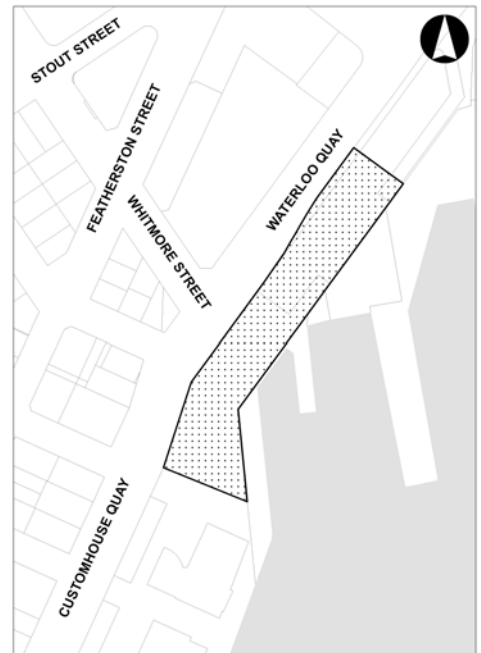
North Kumutoto Precinct

There are an infinite range of design solutions as to how a building could sit in Block A, B or C and there needs to be design flexibility that can respond to these locations; hence the requirement of exceptional design that will deliver on the intent of this design guide.