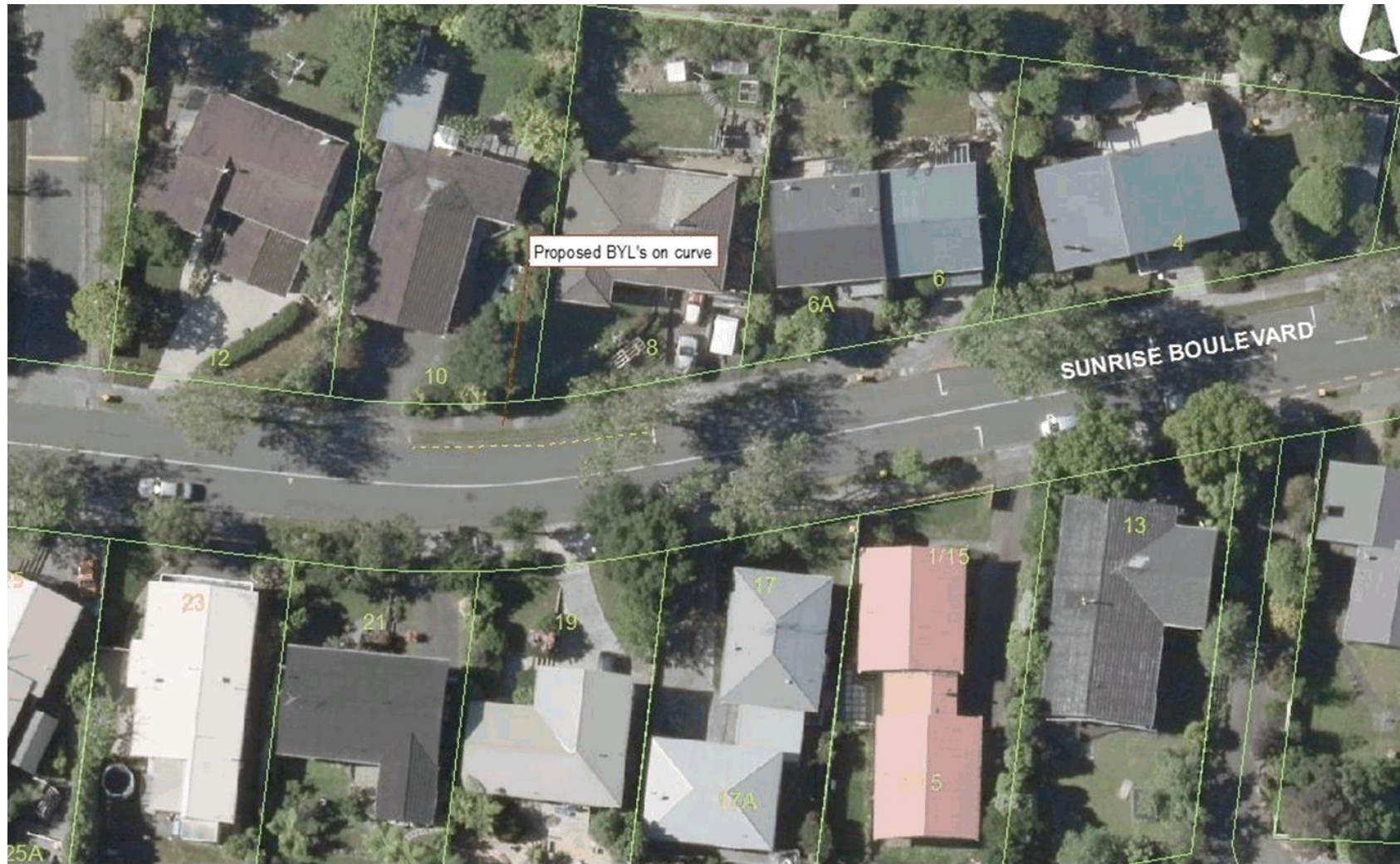
Sunrise Boulevard Tawa TR (70-14) Proposed No stopping at all times

MAP PRODUCED BY: Wellington City Council