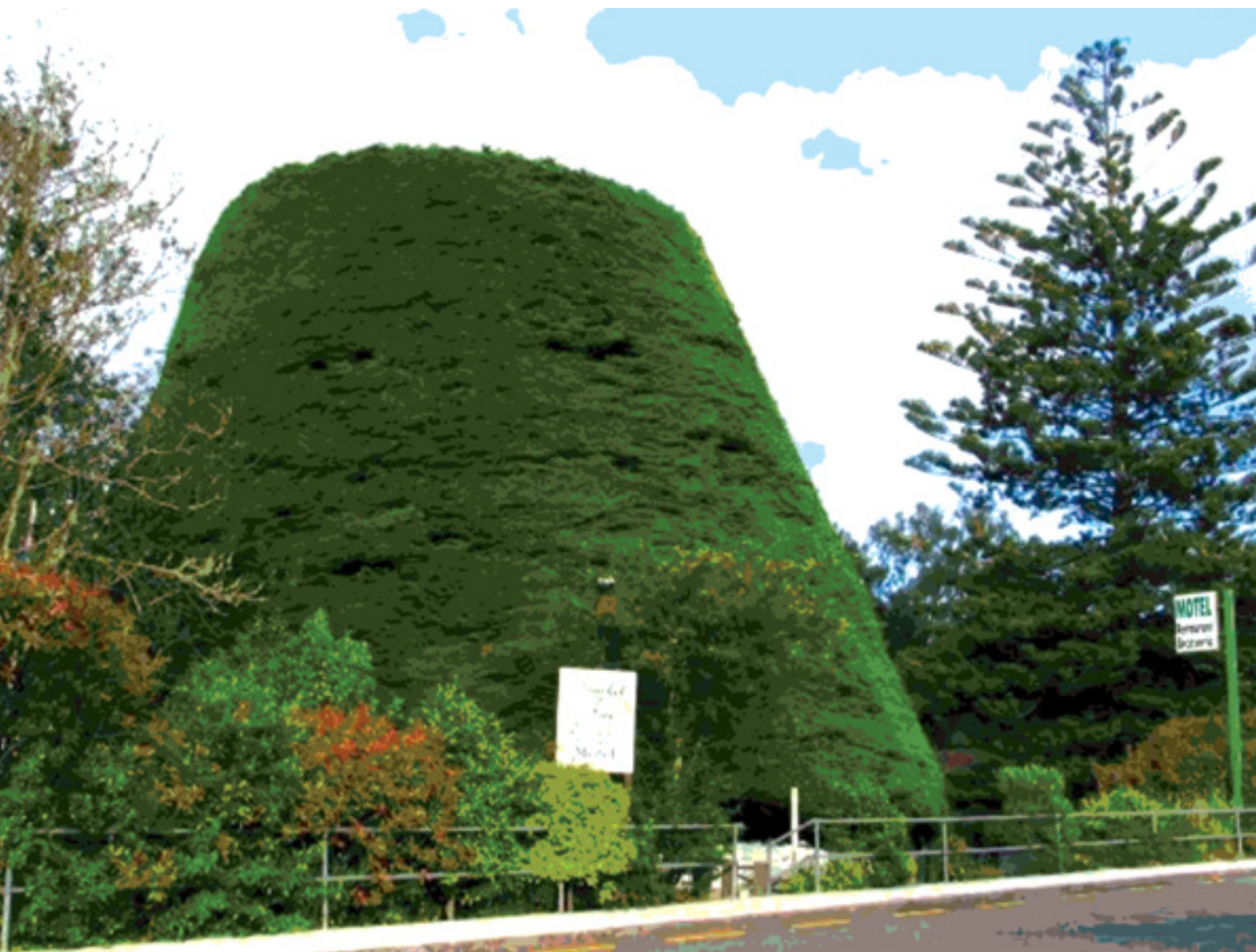
Bucket Tree, 1 Boscobel Lane, Tawa