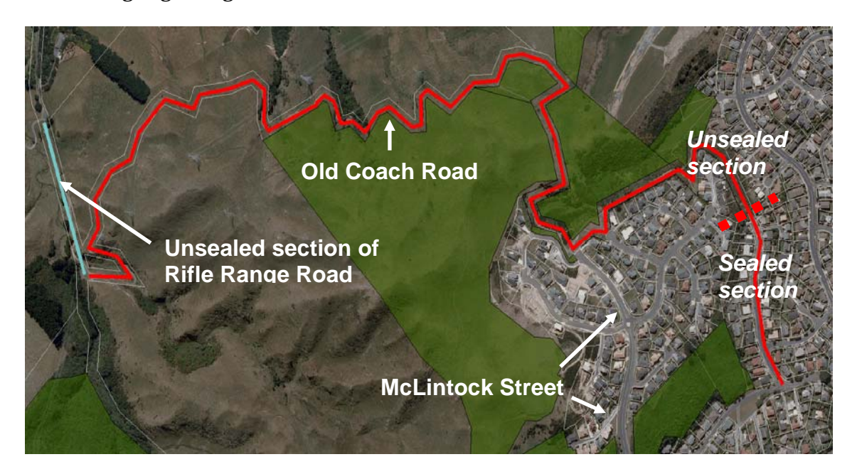
Figure 1: Map of Old Coach Road (highlighted green areas = Council owned land)

Residential housing in Johnsonville borders the unsealed Old Coach Road. As part of the earthworks associated with the development of the housing on McLintock Street, approximately 250m of the original track was covered with fill in the early 1990's.