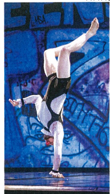
Carnival of the Animals by Circa part of the