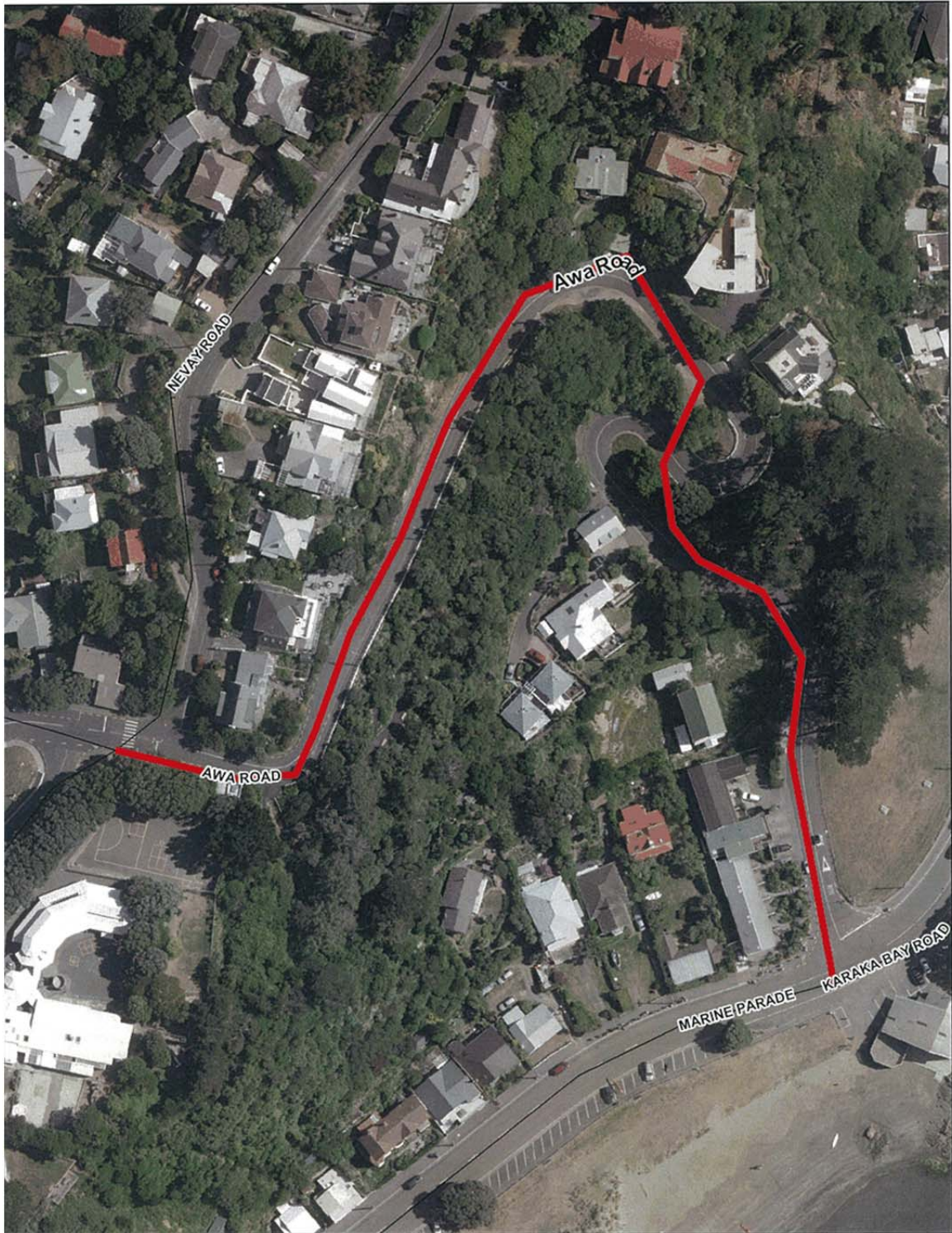
Worser Bay Gut Buster Sunday 17 July 2016 8.30am to 10.30am Awa Road (Marine Parade intersection to Nevay Road/Seatoun Heights)