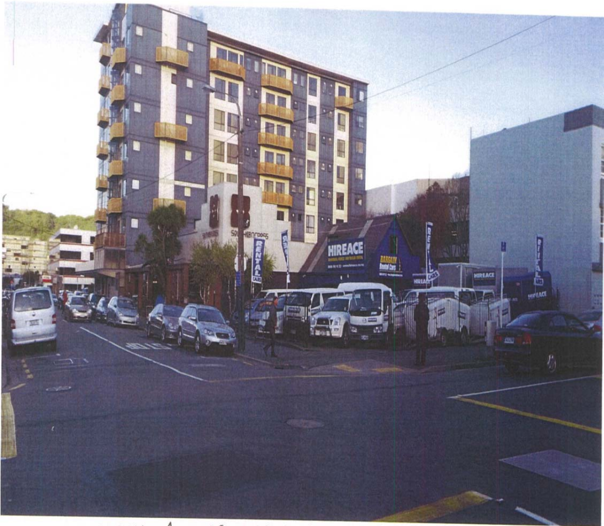
VIEW of SITE FROM OPPOSITE CORNER