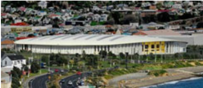
Picture: Indoor Community Sports Centre, Cobham Drive

Wellington City Council is undertaking significant venue upgrades including installation of synthetic turf facilities and the construction of a 12 court Indoor Community Sports Centre (ICSC). The ICSC has now cleared all resource consent and planning obstacles. Work is expected to commence in November 2009 with opening scheduled for mid 2011.