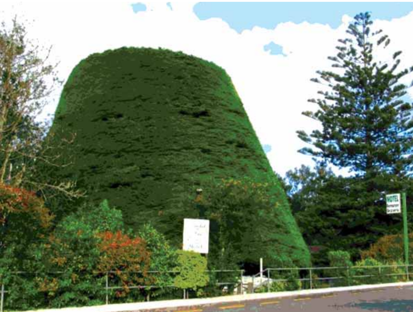
Bucket Tree, 1 Boscobel Lane, Tawa