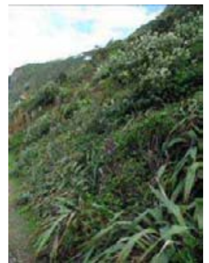
Coastal escarpment, Breaker Bay

The south-facing side (Breaker Bay) has dense regenerating coastal vegetation including wharariki or coastal flax ( Phormium cookianum ) and taupata ( Coprosma repens ). The rocky cliffs at the harbour entrance are sparsely vegetated, in some cases due to erosion but also evidence of the extreme coastal environment. The high winds and salt levels limit what plants will grow at this site. There is a small existing dune containing scattered spinifex or kowhangatara ( Spinifex sericeus ) and pingao ( Ficinia spiralis ) below the cliffs. There are few examples of indigenous dune habitat around the south coast, and most of these are affected by roads and seawalls.