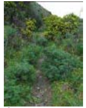
Weeds growing over a track

an education programme around being 'good neighbours' to the reserve as part of the restoration programme. The issue of cats in the reserve and potential methods to reduce their impact (eg bell wearing, keeping them in at night) will be included in the information provided.