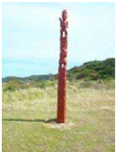
Pou whenua at Oruaiti Pā

The site was occupied for centuries until Ngāti Ira took over from their Ngāi Tara relations and intermarried with them. In the early 18th century, the heke (migrations) of the Taranaki tribes occurred into and around Te Whanganui-a-Tara.