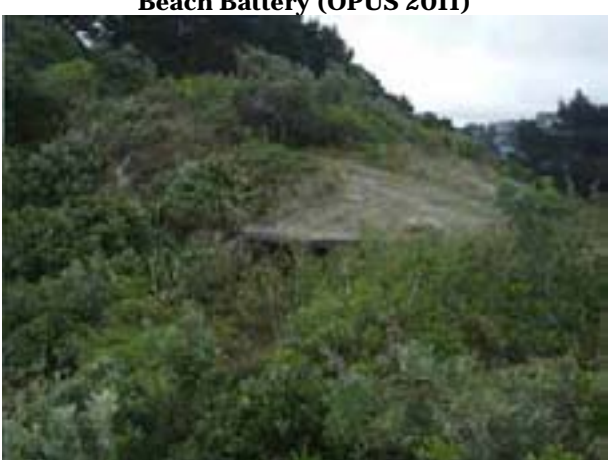
Buried emplacement – Gap Battery (OPUS 2011)