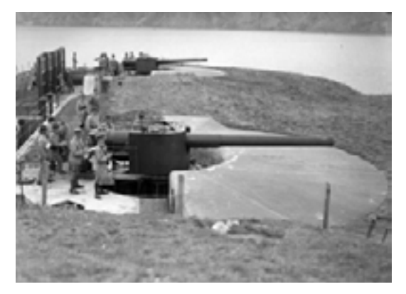
1937 photo of original 6-inch gun emplacements positioned facing south over the harbour entrance.

When New Zealand Company representative William Wakefield arrived in 1839, Te Atiawa Māori were resident on Motu Kairangi (Miramar Peninsula) but it was not considered one of the main areas of occupation as there were no major Te Atiawa pā or kaingā (villages) there.