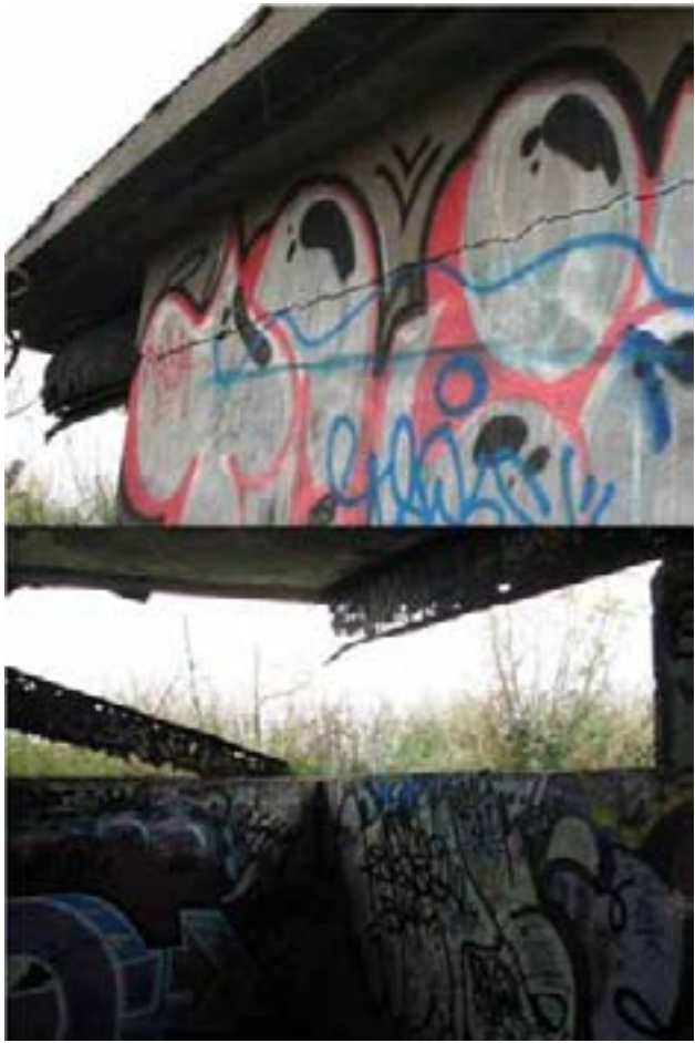
Observation post (OPUS 2011)

There is no on-site information to help visitors find out about Oruaiti Pā and the remaining defence buildings, though some guided walks have been organised in the past to help interpret the site.