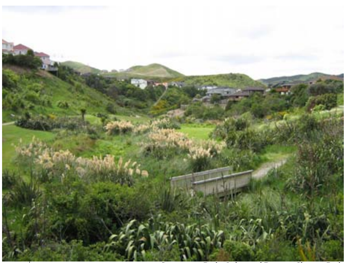
Community Park - Lakewood Reserve, Churton Park