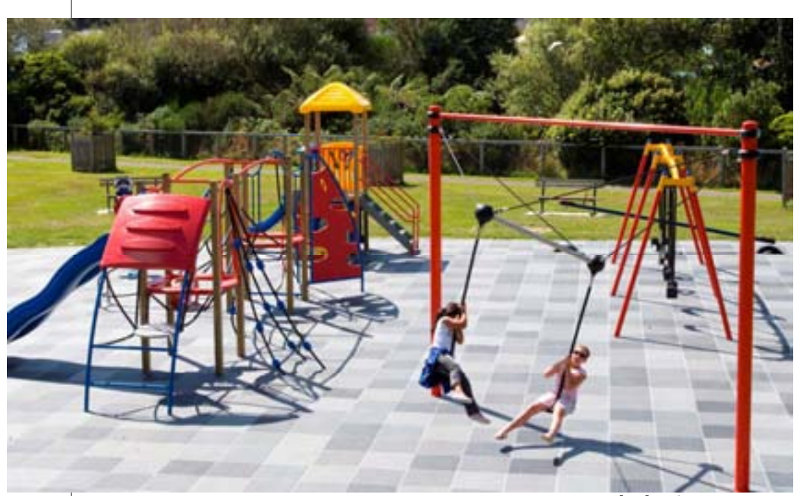
Duncan Park Play Area, Tawa