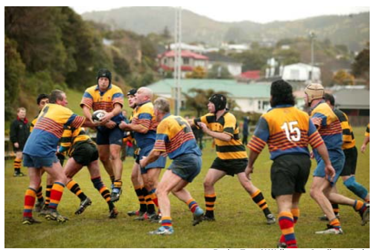
Rugby, Tawa V Wellington, Lyndhurst Park