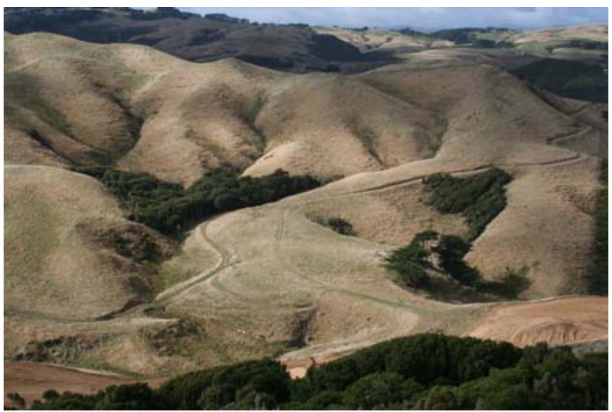
Steep slopes and waterways of the western slopes of Marshalls Ridge, Stebbings Valley