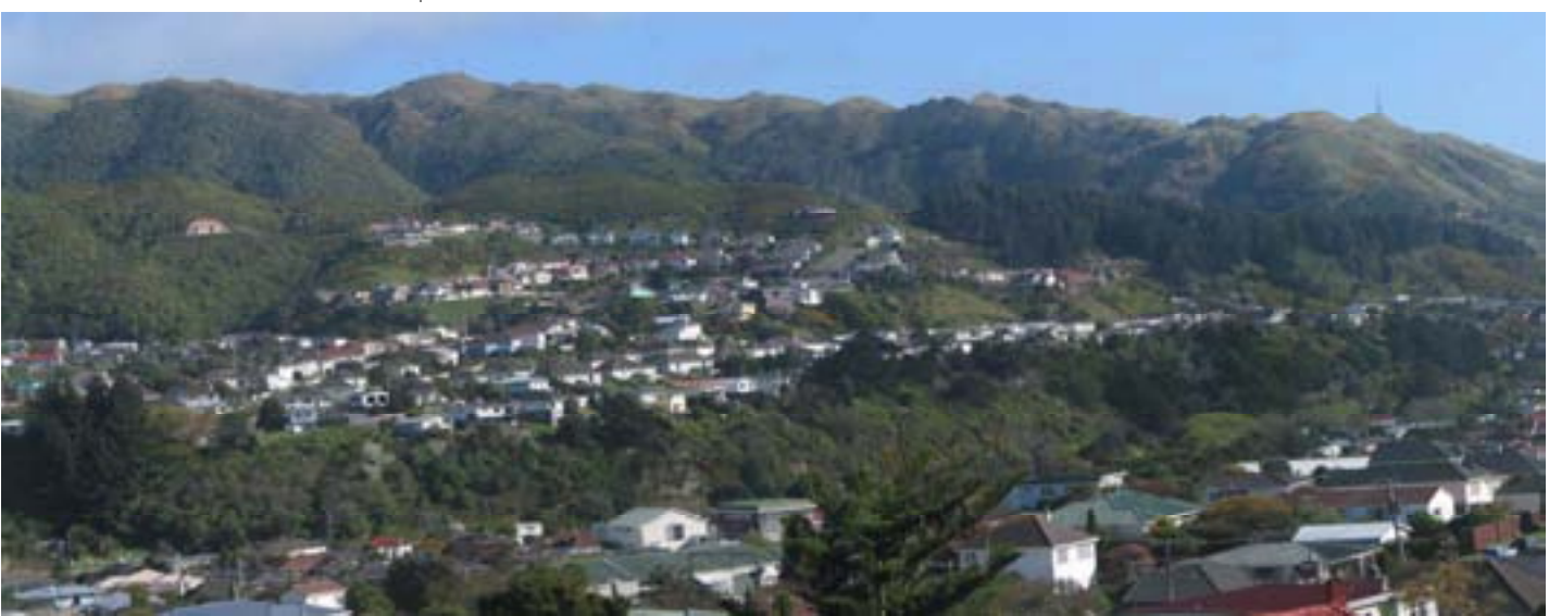
Landscape features and development, Tawa.

of the land and its contour give emphasis to landform. Well integrated patterns of open space tend to include the areas of ecological significance and simultaneously provide tracks for walkers and cyclists.