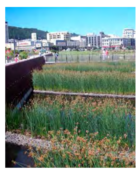
Figure 38. Innovative ways to provide green infrastructure within buildings will be investigated, the example above slows the water on its path to the stormwater system by using planting.

Consider the uses of open space in environmental emergencies and ensure they provide refuge.