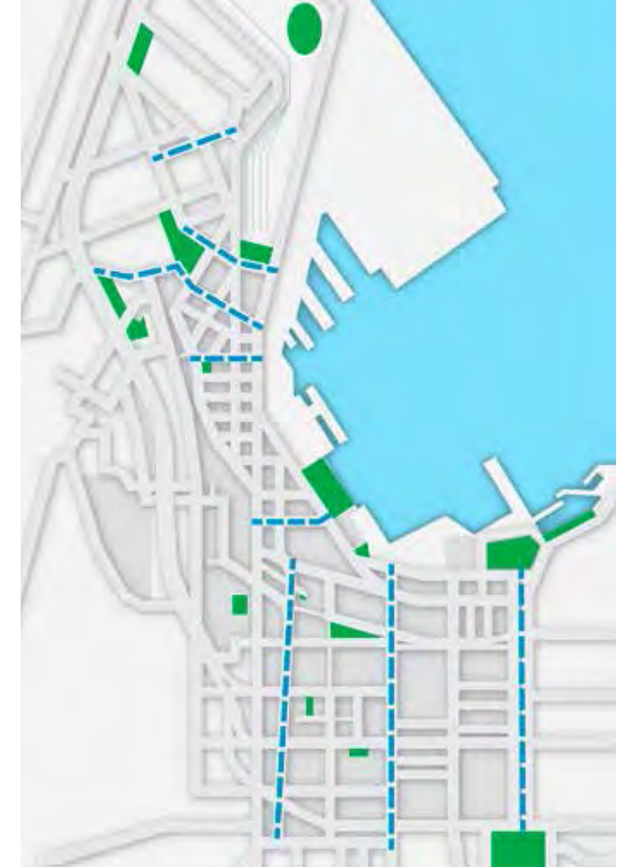
Figure 39. Green areas show existing parks spaces, blue dashed lines show indicative location of historic streams.