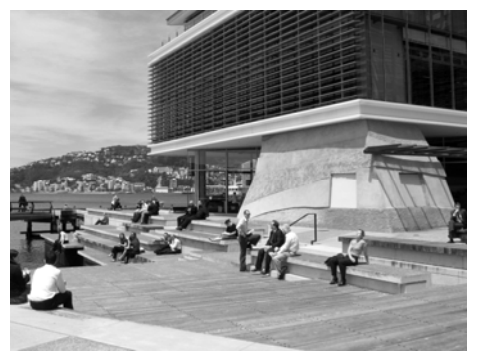
Public space on active frontage