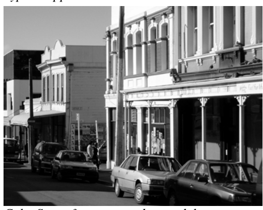
Cuba Street frontages and verandahs

Activities at the ground floor of buildings are part of the street scene here. Shop interiors should be made visible to passers-by, without compromising the characteristic baseboard and window frame pattern of existing older shops.