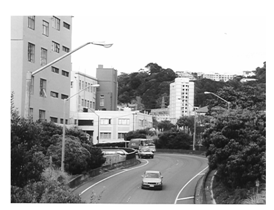
Consider approach views