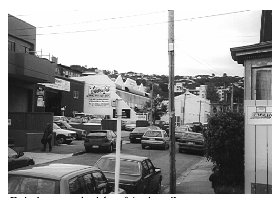
Existing south side of Arthur Street

(TA) Develop narrow building frontages and frequent entrances. These will enhance the diversity of activity in Arthur Street, and the fine-grained quality of activity and building form around upper Cuba Street in general.