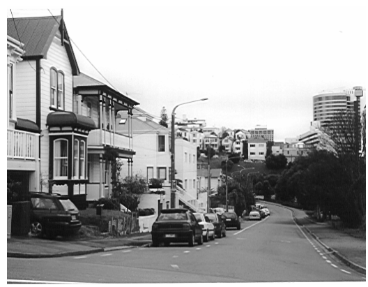
Fine grained development in Buller Street

Buildings at the edge of the Bypass and Vivian Street are also prominent when viewed by those entering the city from the north. Such visual prominence justifies giving special consideration to their appearance.