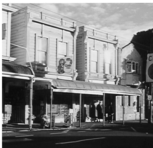
Typical upper Willis Street retail

(TA) G4.3 Use verandah posts at these frontages to continue the pattern established along these streets. (TA) G4.4