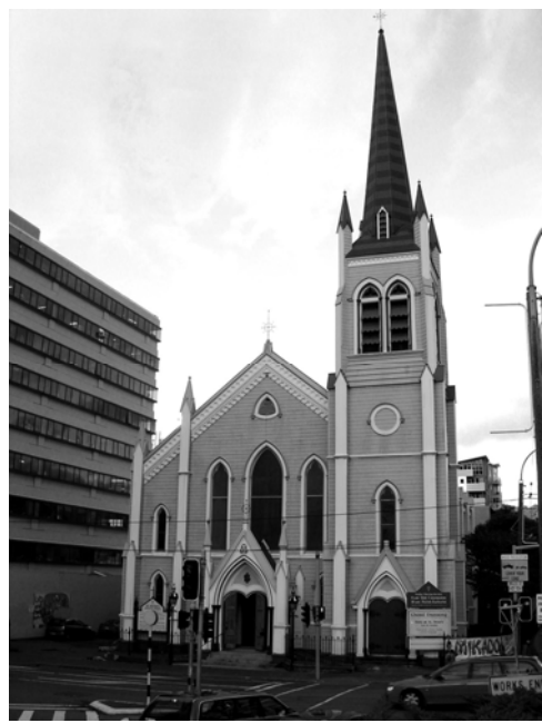
St. Peter's Church

The dimensions of a colonnade or similar element should relate to the scale of St Peters' façade, and to the two storey buildings and verandas further along Willis Street. It should also allow public occupation of this space and views south along the west side of Willis Street to the corner of the Red Cross building.