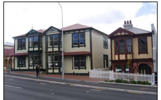
No parking between buildings and the street frontage

(TA) G3.7 The provision of car parking (or manoeuvring spaces) between the building and the street edge is inappropriate.