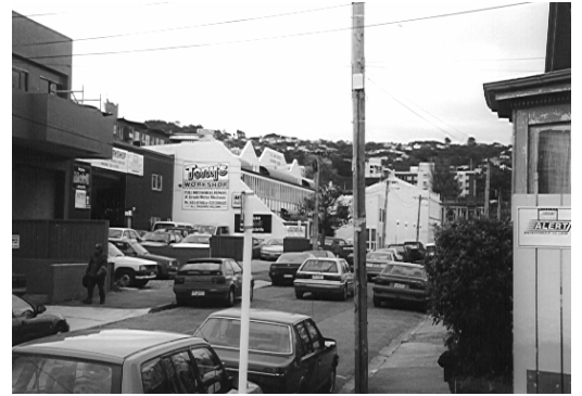
Existing south side of Arthur Street