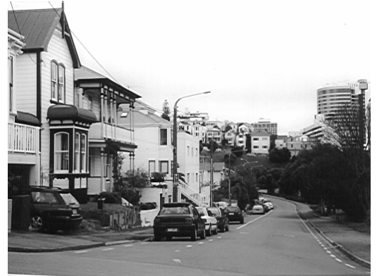
Fine grained development in Buller Street

Buildings at the edge of the Bypass and Vivian Street are also prominent when viewed by those entering the city from the north. Such visual prominence justifies giving special consideration to their appearance.