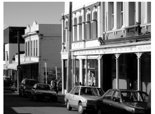
Cuba Street frontages and verandahs

(TA) G4.4 Activities at the ground floor of buildings are part of the street scene here. Shop interiors should be made visible to passers-by, without compromising the characteristic baseboard and window frame pattern of existing older shops.