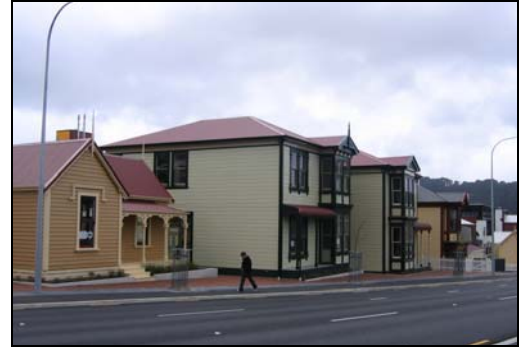
Staggered building set-backs on the northern edge of Karo Drive

(TA) G3.3 On the southern edge of the Bypass, between Cuba Street and Victoria Street, the existing cadastral grid with its north/south alignment should be recognised. Buildings should be aligned to reinforce the north/south pattern, with a resultant stepping of the building frontages along the street face to reflect the stepping of the buildings on the north side of the Bypass.