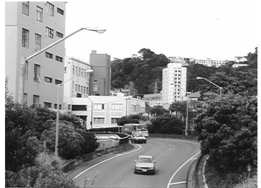
Consider approach views