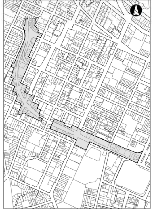
Te Aro Corridor

The character of the Te Aro Corridor varies along its length, from the proposed public park opposite the prominent National War