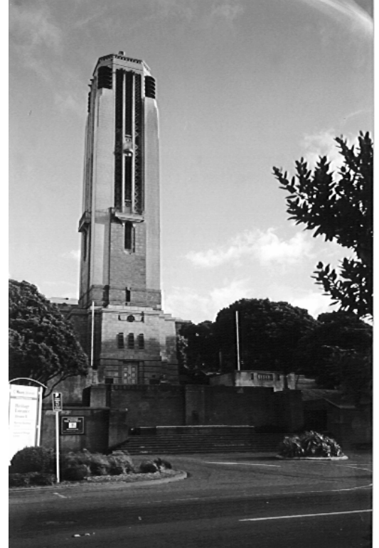
The National War Memorial

The existing brick buildings on the corners of Buckle & Tasman Streets (Police Barracks) and Buckle & Taranaki Sts (Defence Building) provide strong corners to this otherwise vehicle-dominated frontage.