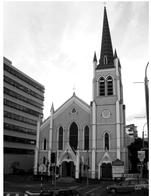
St. Peter's Church of the land owned and occupied by the

The dimensions of a colonnade or similar element should relate to the scale of St Peters' façade, and to the two storey buildings and verandas further along Willis Street. It should also allow public occupation of this space and views south along the west side of Willis Street to the corner of the Red Cross building.