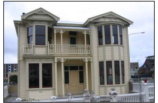
A rich urban street with fine grain

(TA) G3.5 Encourage development of a vertical nature (such as terrace housing and work/live units) to encourage narrow frontages that reflect the fine grain and generally vertical nature of buildings in the area.