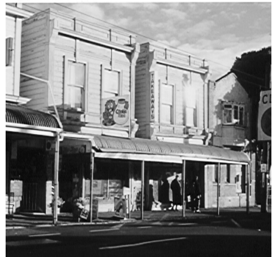
Typical upper Willis Street retail

(TA) G4.2 Accentuate the importance of Willis Street by locating primary building frontages along them.