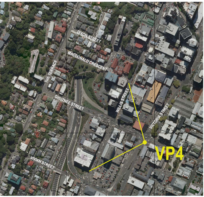
Key plan of view point location