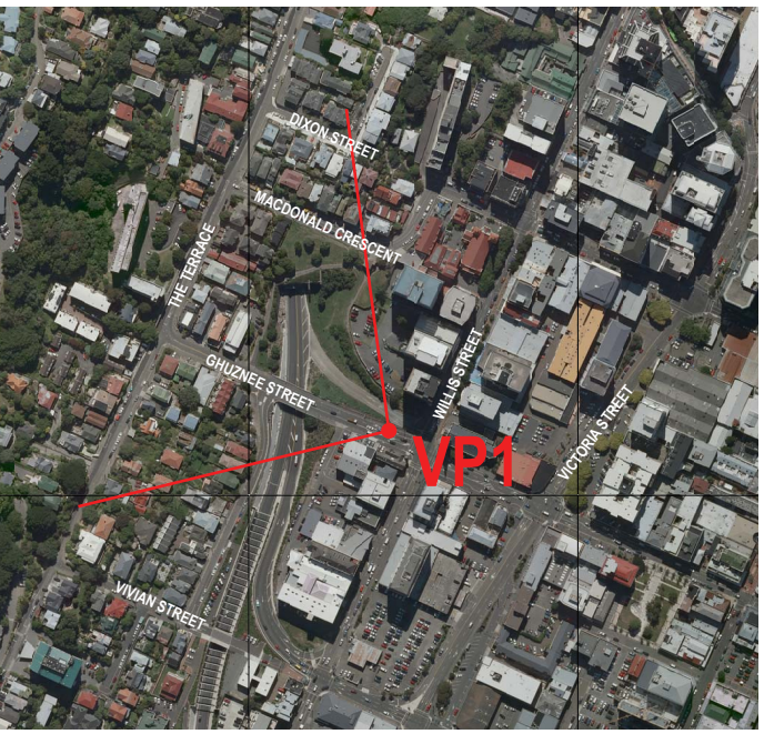
Key plan of view point location