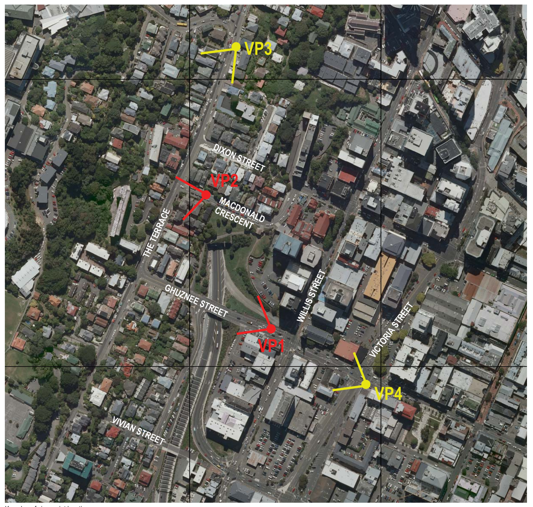
Key plan of view point locations Viewpoints included in DPC81 submission shown Red Proposed additional viewpoints shown Yellow