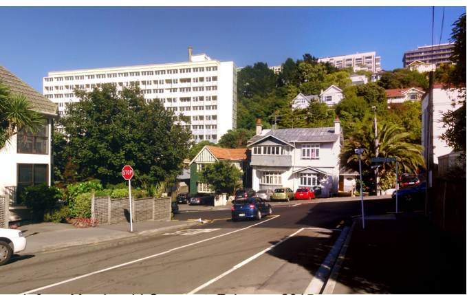
Photograph from Macdonald Crescent. February 2015