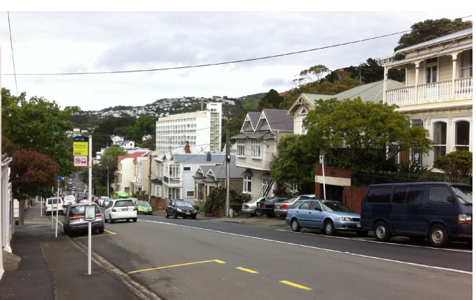
Photograph from The Terrace. November 2015