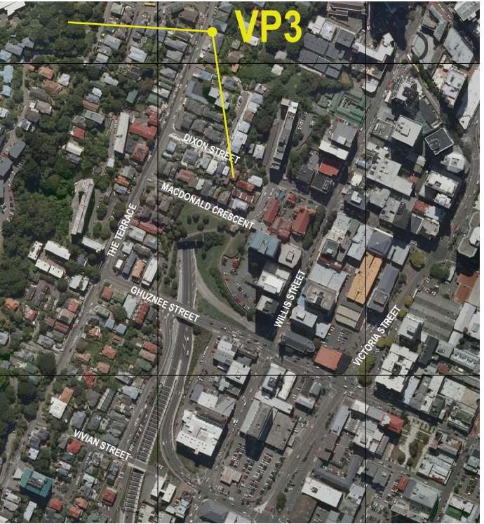
Key plan of view point location