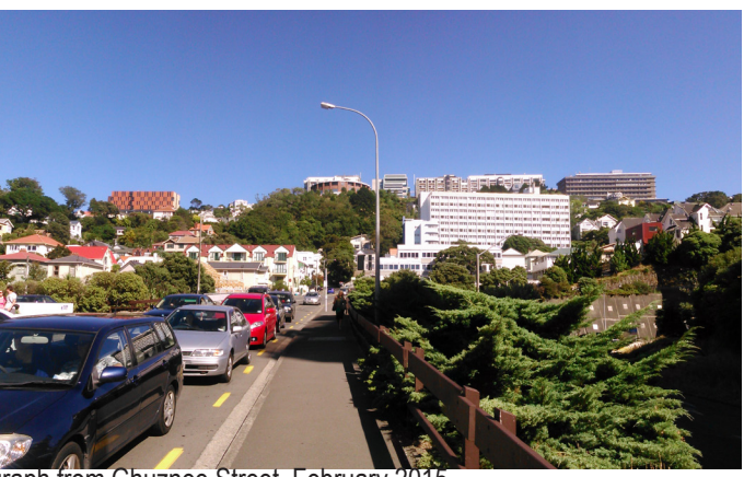
Photograph from Ghuznee Street. February 2015