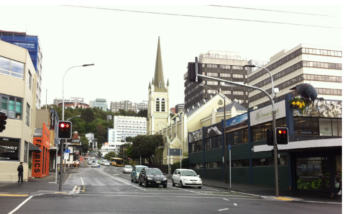
Photograph from corner of Victoria and Ghuznee Street. November 2015