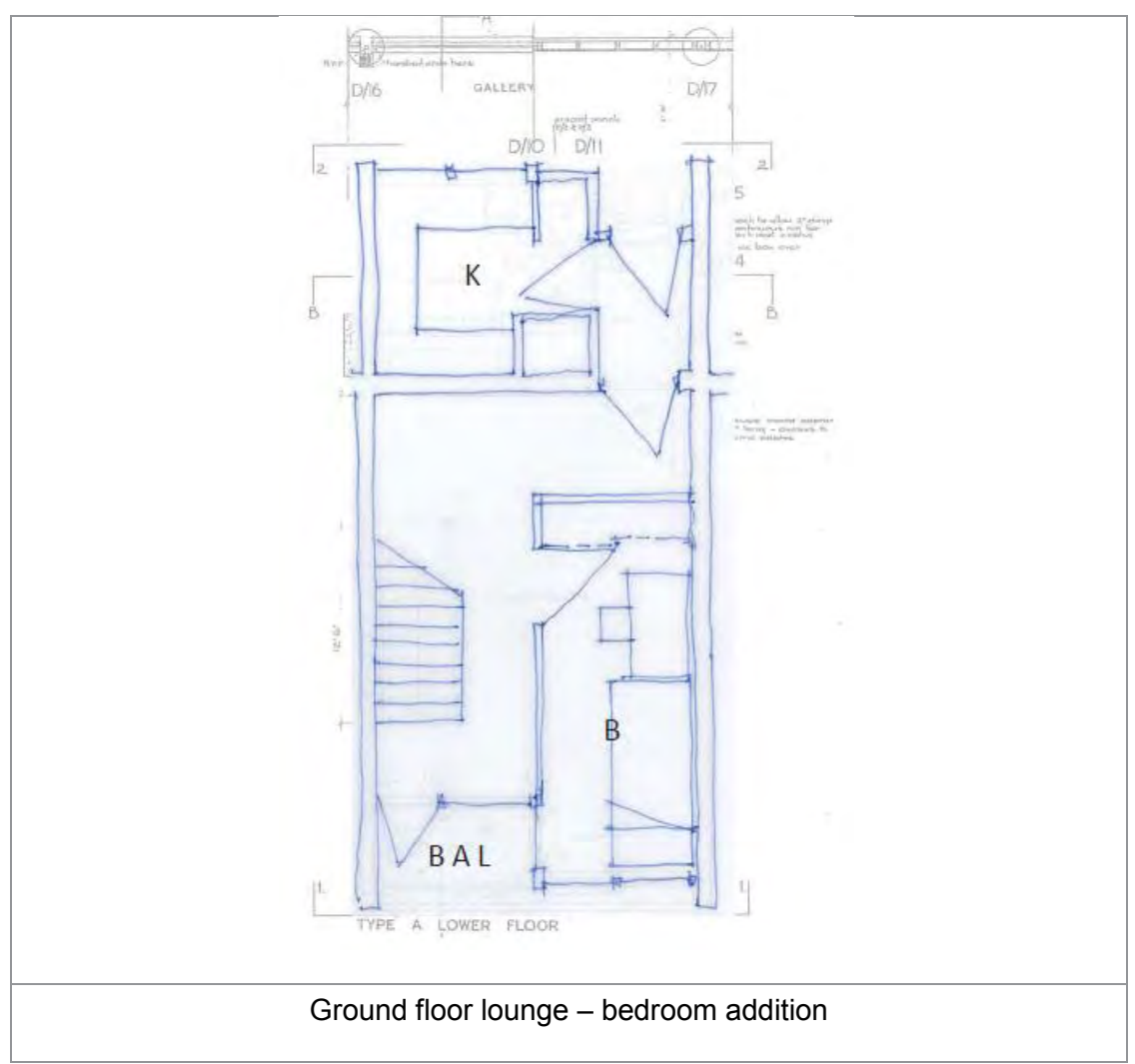
Figure 4: Additional Bedroom in Lounge

Athfield Architects has considered options to increase the bedroom numbers. The following figure demonstrates the addition of one bedroom into the current lounge space.