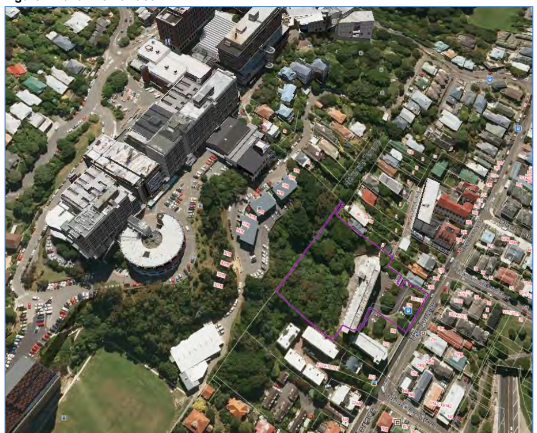
Figure 1: 320 The Terrace

The following figure demonstrates the property's location and boundaries. It also demonstrates that the building dissects the site in a (generally) north south direction.