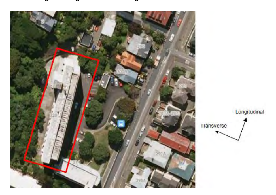
Figure 6: Building Showing Direction of Longitudinal and Transverse Walls

Given the building's separation from other buildings on the Kelburn Campus it would be preferable to accommodate one department, school or service (Property Services or IT Support for example).