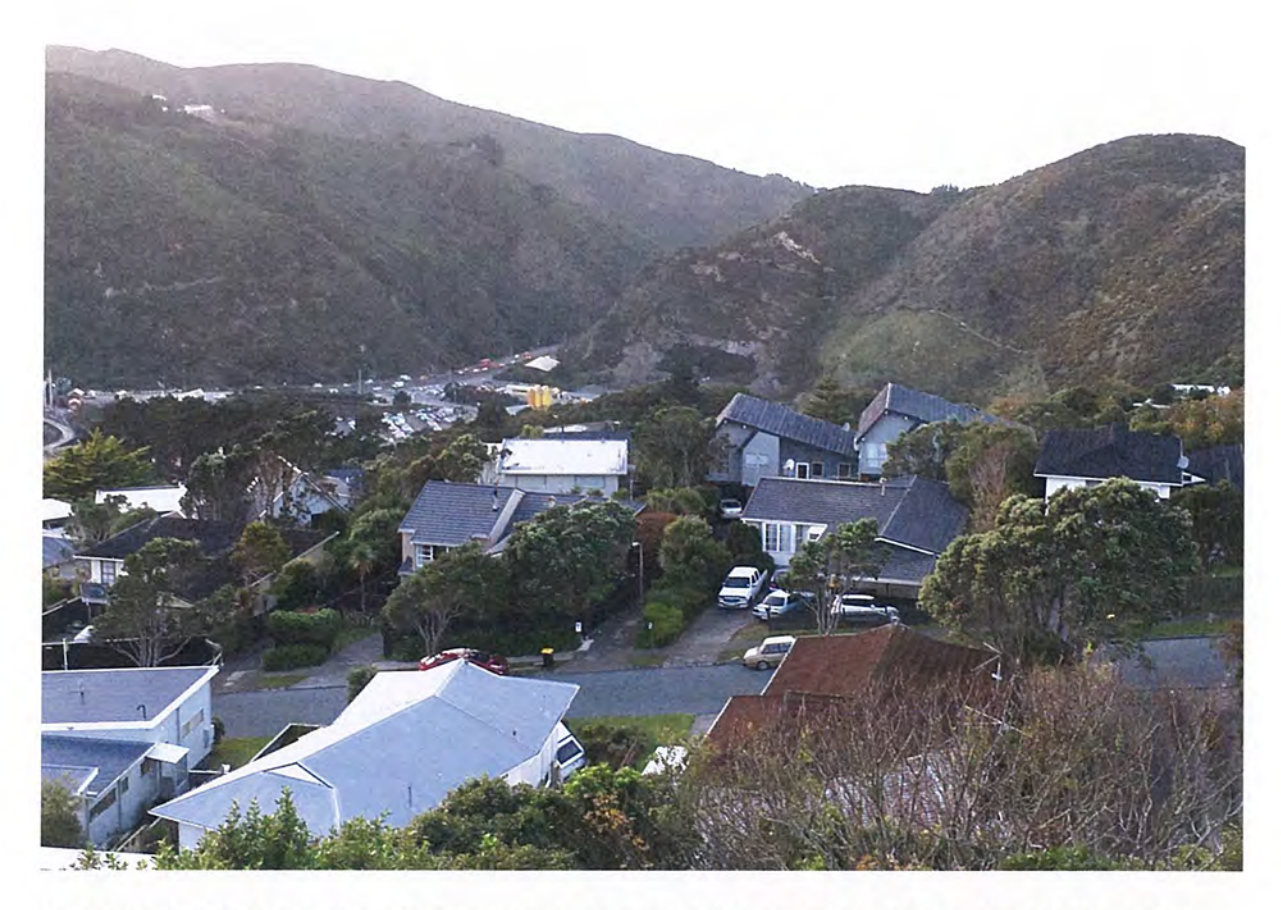
Image 3: Evidence of the previous quarrying around the proposed extension of the quarry.