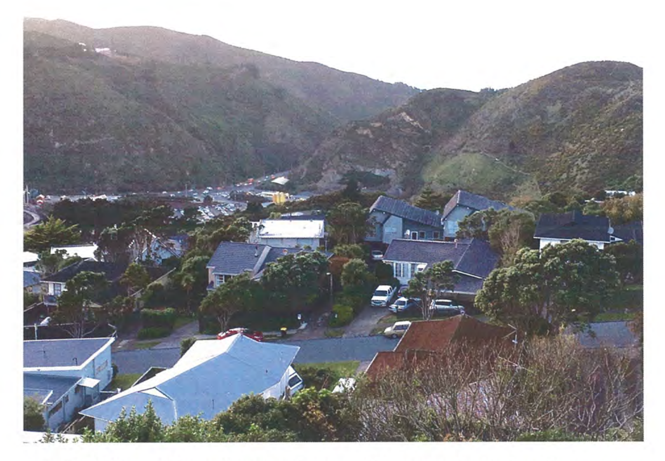
Image 3: Evidence of the previous quarrying around the proposed extension of the quarry.

This will extend to make the entire area look like a massive quarry. There will be further slurry dumps and industrialisation of the area. The screens proposed have been suggested on the roadside, hence this would no difference to these images and the further scarring of the landscape for those residents living around the quarry.