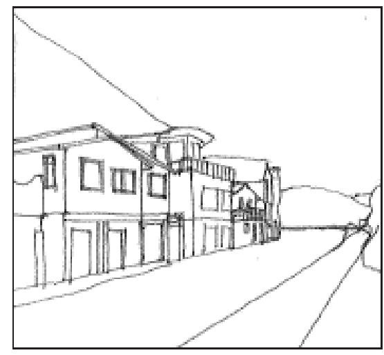
Strong edge definition

Where there is no setback, the visual connection between the inhabitants and the public life of the coastal road is further intensified.