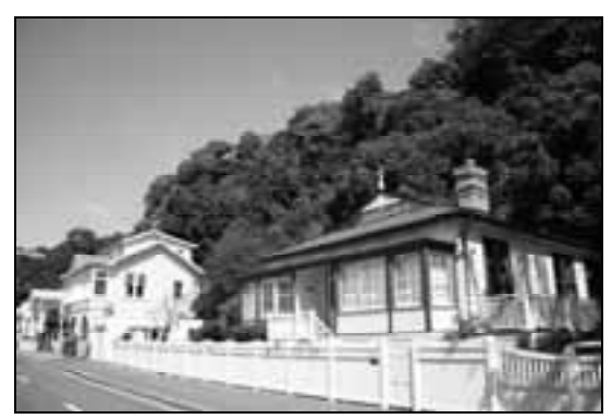
Buildings are generally orientated towards the road

Although there is a diverse range of building types there is a commonality of design features throughout the area such as (often large) windows, entrances, decks, balconies and their attendant living spaces that are orientated toward the road.