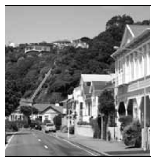
A strongly defined street edge gives the perception of density.

Buildings are generally limited to the flat area of each site in front of the escarpment. This reinforces the effect of concentration and intensity along the street edge.