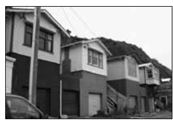
Car parking is typically under or at the back of dwellings

Car parking is typically in garages and generally integrated with the building on the ground floor of the residence or provided for at the back of a building. Accessory buildings in front of dwellings are generally discouraged.