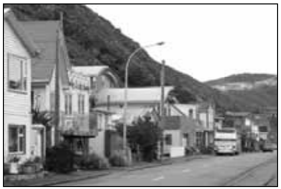
The minimal setbacks have lead to very shallow or no front gardens

Where there is a setback, most properties have front fences which continue the line of the road edge. These are generally at a height that still enables a visual connection between the residents and the public.