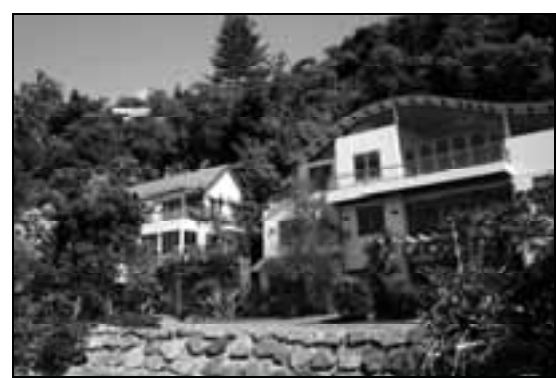
Mixture of roof forms

The Residential Coastal Edge is characterised by a mix of roof types including skillion, curved and papapet/flat, gable and hip roofs.