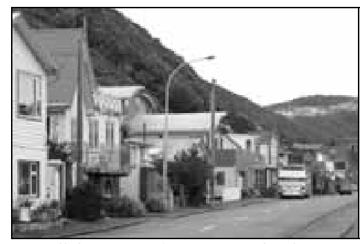
Overall diversity in form, type and style

There are also a number of individual 'remnant' baches from when the coastal edge would have attracted weekend use or possibly would have been used by fishermen. The only consistency of these buildings is perhaps their age and modest nature, but their materials, form and styles are variable.