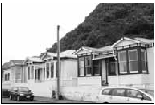
Small groupings of consistent styles