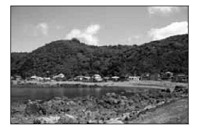
Strong relationship between the natural and built environment

The Residential Coastal Edge is a highly valued residential area with strong amenity value. The area is also an important recreational destination. The steep escarpment behind the dwellings further defines the Residential Coastal Edge by pushing the buildings to the street edge thus increasing the sense of interaction between the public and private dimensions of the area.