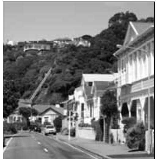
A strongly defined street edge gives the perception of density.

Buildings are generally limited to the flat area of each site in front of the escarpment. This reinforces the effect of concentration and intensity along the street edge.