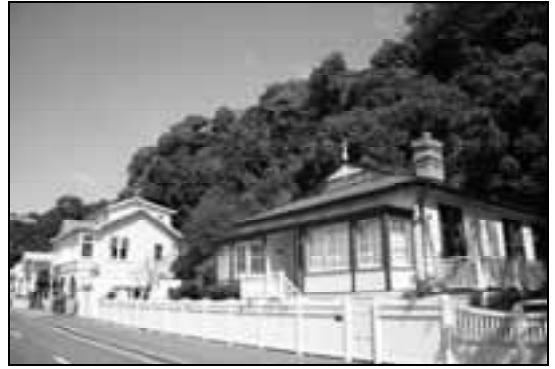
Buildings are generally orientated towards the road

Although there is a diverse range of building types there is a commonality of design features throughout the area such as (often large) windows, entrances, decks, balconies and their attendant living spaces that are orientated toward the road.