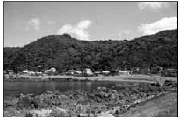
Strong relationship between the natural and built environment

The Residential Coastal Edge is a highly valued residential area with strong amenity value. The area is also an important recreational destination. The steep escarpment behind the dwellings further defines the Residential Coastal Edge by pushing the buildings to the street edge thus increasing the sense of interaction between the public and private dimensions of the area.