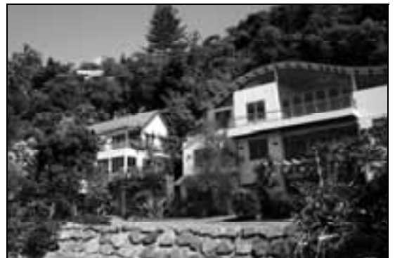
Mixture of roof forms

The Residential Coastal Edge is characterised by a mix of roof types including skillion, curved and papapet/flat, gable and hip roofs.