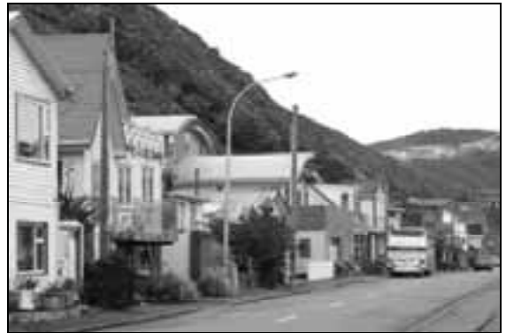
The minimal setbacks have lead to very shallow or no front gardens

Where there is a setback, most properties have front fences which continue the line of the road edge. These are generally at a height that still enables a visual connection between the residents and the public.