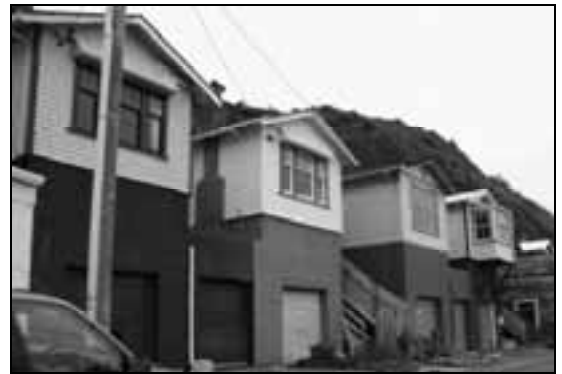
Car parking is typically under or at the back of dwellings

Car parking is typically in garages and generally integrated with the building on the ground floor of the residence or provided for at the back of a building. Accessory buildings in front of dwellings are generally discouraged.