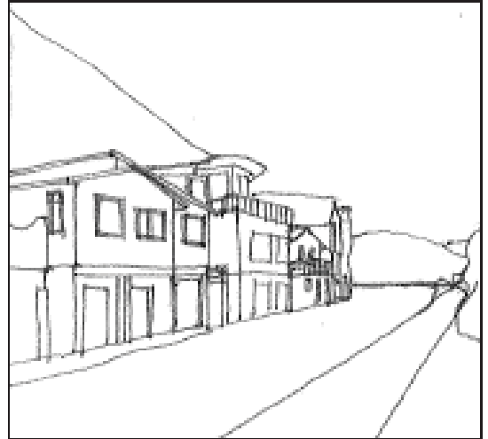
Strong edge definition

Where there is no setback, the visual connection between the inhabitants and the public life of the coastal road is further intensified.