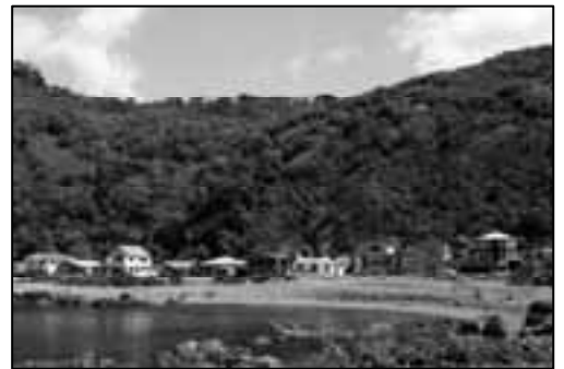
Strong relationship between the built environment and the escarpment

The steep topography around the Residential Coastal Edge has meant that in most cases the escarpment is still generally intact and undeveloped. This has given it a visual prominence and intensity that makes it more sensitive to changes in character than a typical suburban streetscape. Development that altered this escarpment (through increased building heights or development within the escarpment) would negatively impact on this character.