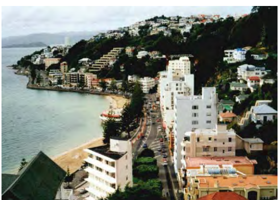
Oriental Parade - a visually prominent area with strong identity