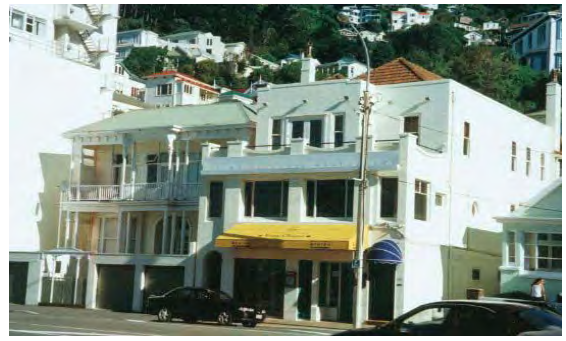
Predominance of light exterior colours, variety of external materials

Buildings along Oriental Parade use a variety of external materials ranging from weatherboard cladding and corrugated iron to concrete, plaster finish and roof tiles. Despite the variety of cladding materials, the area as a whole is characterised by predominantly light exterior colours.