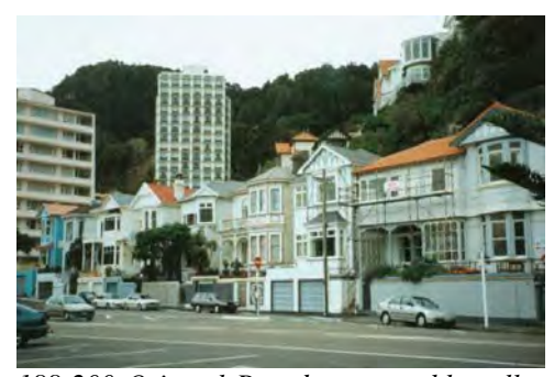
188-200 Oriental Parade - a notable collection of listed heritage buildings with consistent age, form and scale

Oriental Parade has a linear form, constrained by the adjacent hills and a general lack of flat land. The structure of the area is characterised by long narrow blocks and a limited number of cross streets.