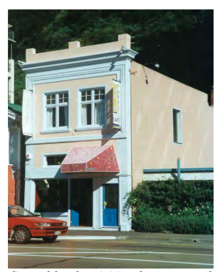
Ground level activities that support the public use of the area