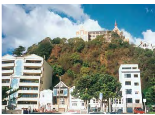
Building tops that project directly against the greenery of the escarpment - a particular concern