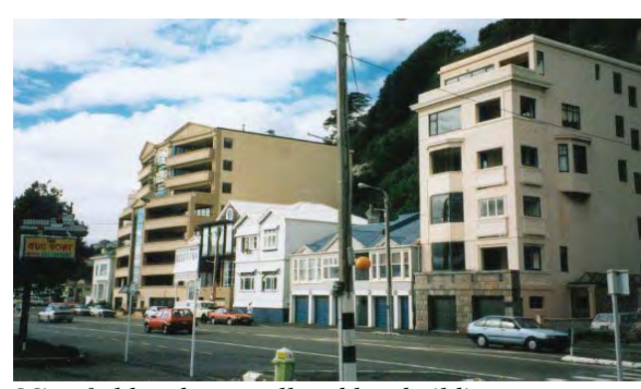
Mix of old and new, tall and low buildings