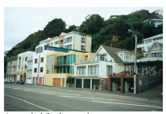
A strongly defined street edge

Oriental Parade buildings present a positive "public face" to the street. Balconies, bay windows and pedestrian entrances are common features of existing building frontages.