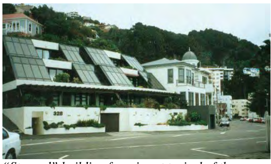
"Stepped" building form is not typical of the area

The design of the tops of taller buildings needs particular consideration to ensure they contribute to a strong and distinctive silhouette line.