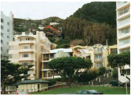
Diversity and visual complexity

The detailed treatment of street elevations is important as it adds visual interest and enhances the quality of the street. This is