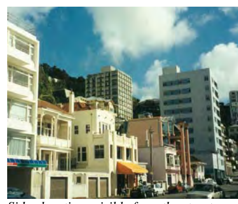
Side elevations visible from the street

The height differences between adjacent buildings along Oriental Parade make their side elevations or parts of them visible from the street. Beyond the range of the street, buildings or parts of them can be seen in relation to each other from the interiors of other buildings or from neighbouring public spaces. The expressive topography of the wider Oriental Bay area provides multiple opportunities for viewing the backs, sides and tops of the Oriental Parade buildings. In this sense all building elevations that can be seen from public spaces or have a direct visual relationship to the street or adjacent buildings, deserve careful design treatment.