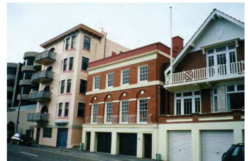
Relationship to heritage buildings is an important design consideration