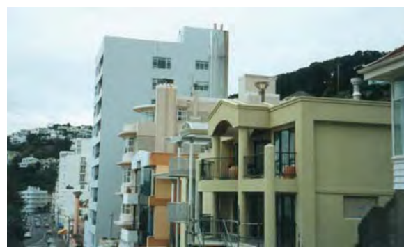
Multi-storey apartment blocks - a recurring building type

Oriental Parade provides opportunities for high density residential development, which often occurs on amalgamated sites. As a result, the building bulk of new development can be visually dominating, especially where the combination of the height, length and/or width of the proposed building is significantly greater than that of its built surroundings.