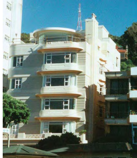
Façade features and detail on side elevations