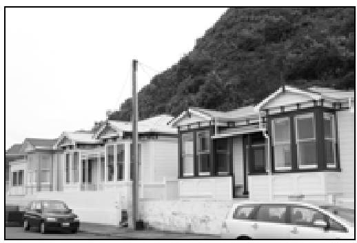
Small groupings of consistent styles