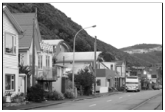
The minimal setbacks have lead to very shallow or no front gardens

Where there is a setback, most properties have front fences which continue the line of the road edge. These are generally at a height that still enables a visual connection between the residents and the public.