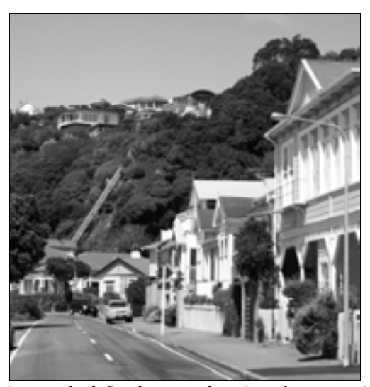
A strongly defined street edge gives the perception of density.

Buildings are generally limited to the flat area of each site in front of the escarpment. This reinforces the effect of concentration and intensity along the street edge.