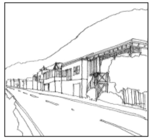
The area is a mixture of one and two storey dwellings

The generally consistent heights of one or two storeys (only a few are taller) above street level along the Residential Coastal Edge generates a clear line in perspective and also serves to accentuate the linear coastal edge and define the escarpment above.