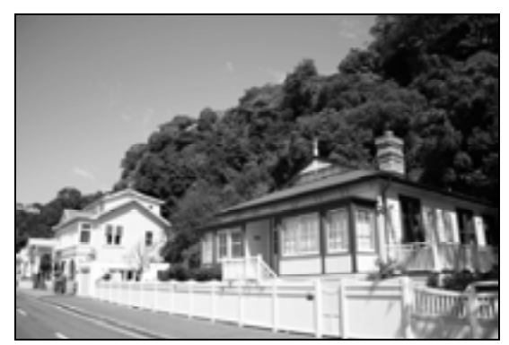
Buildings are generally orientated towards the road

Although there is a diverse range of building types there is a commonality of design features throughout the area such as (often large) windows, entrances, decks, balconies and their attendant living spaces that are orientated toward the road.