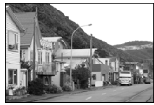
Overall diversity in form, type and style

There are also a number of individual 'remnant' baches from when the coastal edge would have attracted weekend use or possibly would have been used by fishermen. The only consistency of these buildings is perhaps their age and modest nature, but their materials, form and styles are variable.