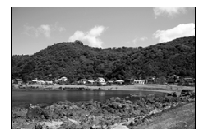
Strong relationship between the natural and built environment

The Residential Coastal Edge is a highly valued residential area with strong amenity value. The area is also an important recreational destination. The steep escarpment behind the dwellings further defines the Residential Coastal Edge by pushing the buildings to the street edge thus increasing the sense of interaction between the public and private dimensions of the area.