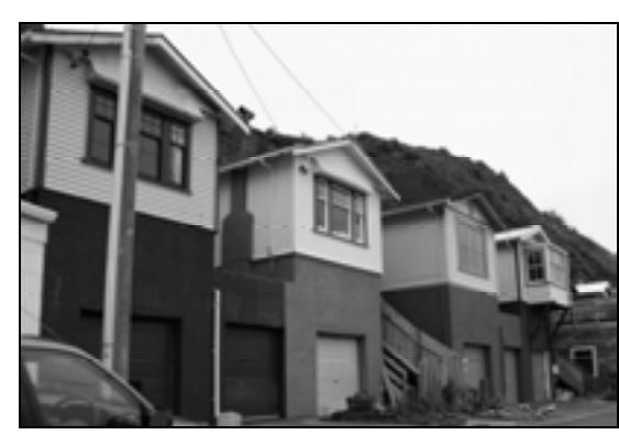
Car parking is typically under or at the back of dwellings

Car parking is typically in garages and generally integrated with the building on the ground floor of the residence or provided for at the back of a building. Accessory buildings in front of dwellings are generally discouraged.