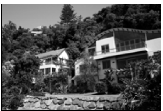
Mixture of roof forms

The Residential Coastal Edge is characterised by a mix of roof types including skillion, curved and papapet/flat, gable and hip roofs.