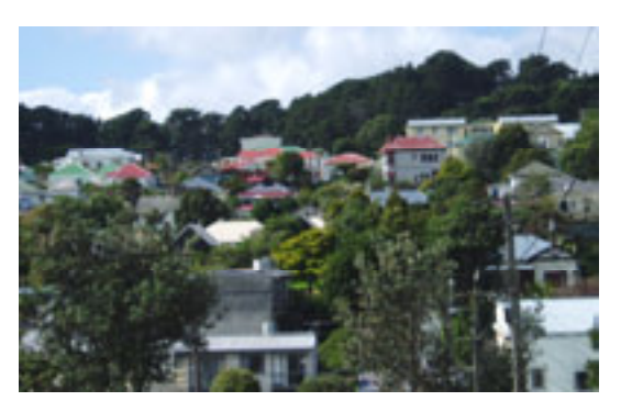
High intensity development is typically compensated for by mid-block open space with mature vegetation

Variation of front yard dimensions usually relates to variation of topography. Dwellings on sites sloping steeply up from the street typically have deeper frontage setback than those on flat or downward sloping sites.