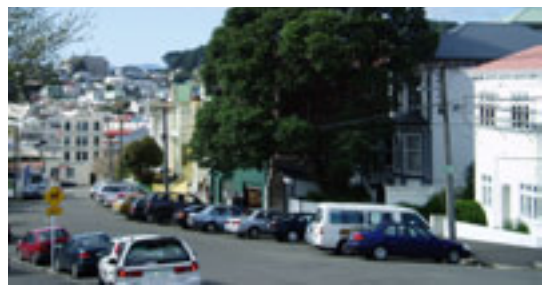
Carparking is typically on the street

Most of the existing garages are found along the higher side of streets. Garages on steep frontages, typically built into the slope and located in front of and below the dwelling, have a lesser impact on the streetscape than free-standing garages.