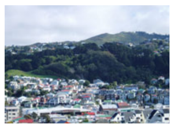
Visual diversity derived from variations in roof form, building height and topography.