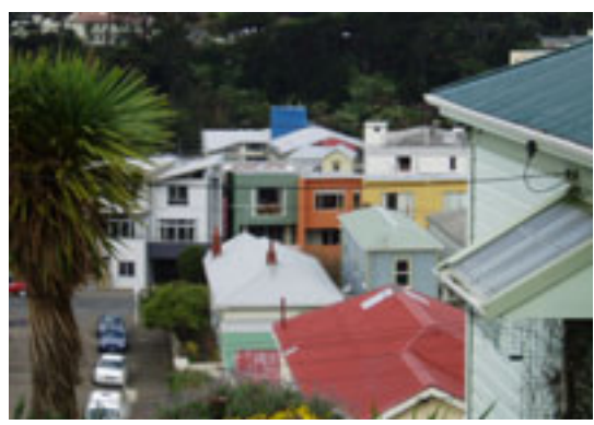
New multi-unit development around Tasman Street