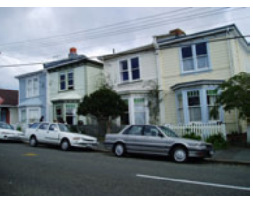
Consistency of character and a high degree of visual unity