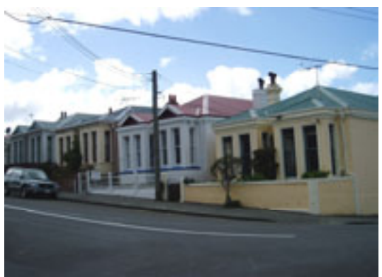
Consistency of building type and scale - notable grouping of semi-detached brick dwellings at the southern end of Rintoul Street