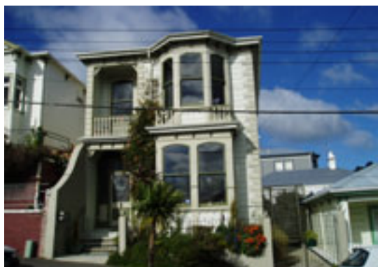
Entrances and main windows addressing the street

Currently most building exteriors are light in colour. However, houses built during the 1890-1910 period were traditionally painted in deeper colours with strong contrasts used to enhance decorative detailing and roof forms.