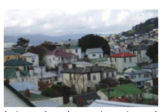
Intricate roofscape demonstrating consistency of roof type and pitch