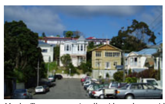
Manley Tce - an exceptionally wide cu-de-sac with a strong sense of place