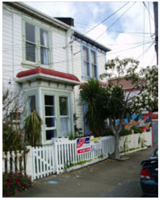
Neighbouring buildings, aligned with each other give a strong street edge definition