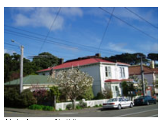
Limited range of building types