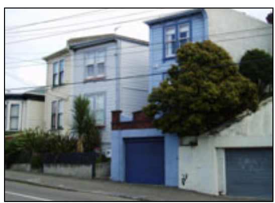
Defined street edge with buildings typically aligned with the street grid