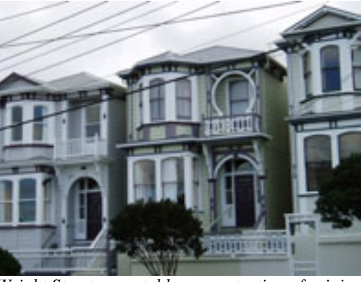
Wright Street - a notable concentration of original dwellings