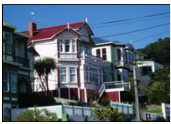
The undulating topography is a strong determinant of the area's overall character

The collective character of Wellington's Southern Inner Residential Areas is determined by the following common patterns: