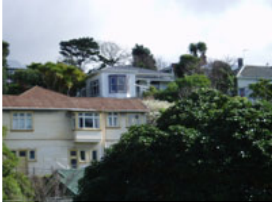
Akatea Street - strong streetscape presence accentuated with prominent mature vegetation