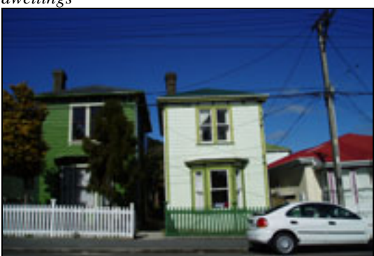
Common building dimensions