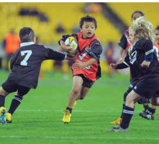
PREMATCH MINI LEAGUE 11 May 2013