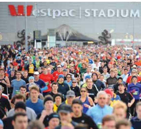
MARATHON 23 June 2013

During the year, Trust staff also provided resources and turf management assistance at the Karori Park cricket ground.