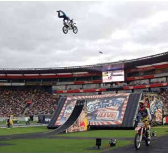
NITRO CIRCUS 9 February 2013