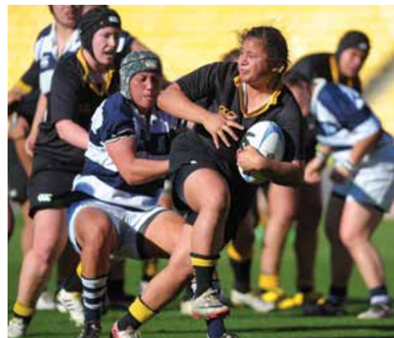
WOMEN'S PROVINCIAL CHAMPIONSHIP WELLINGTON VS AUCKLAND 29 September 2012