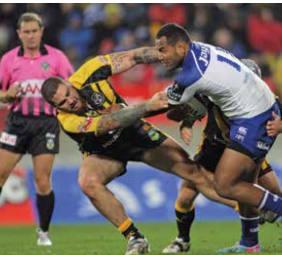
WARRIORS VS BULLDOGS 11 May 2013