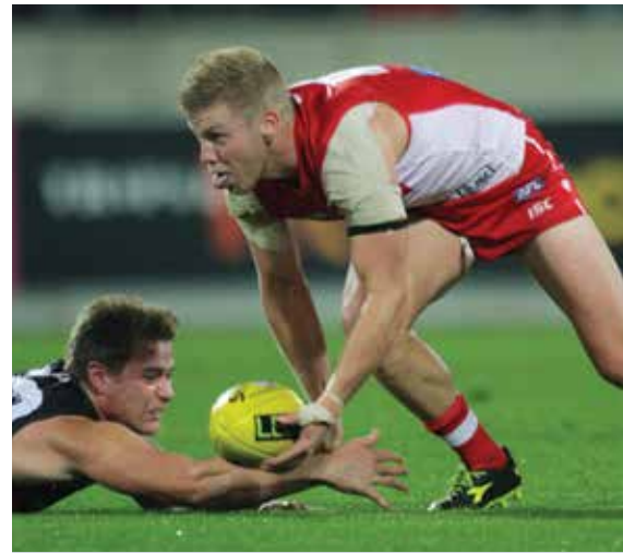
ST KILDA VS SYDNEY SWANS 25 April 2013

The public Mezzanine Bar, currently under construction, will also provide alternative food and beverage options in a relaxed and comfortable atmosphere.