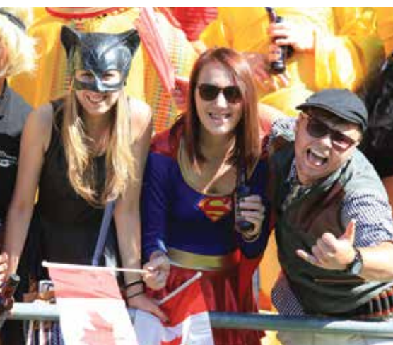
HERTZ SEVENS TOURNAMENT 1-2 February 2013