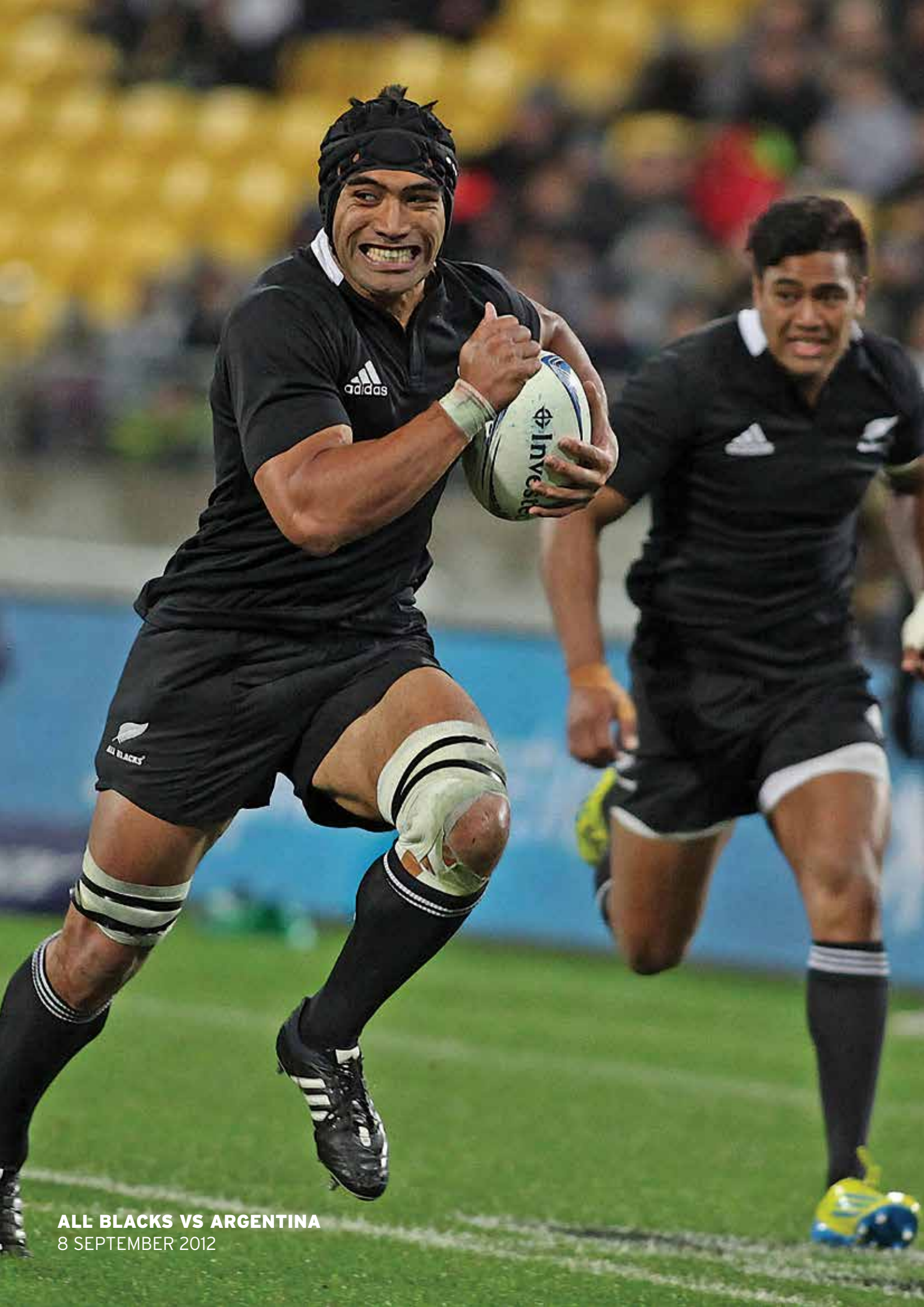
ALL BLACKS VS ARGENTINA 8 SEPTEMBER 2012