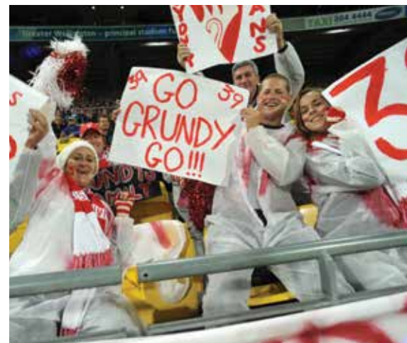
ST KILDA VS SYDNEY SWANS 25 April 2013