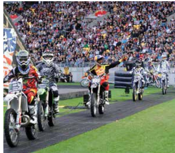
NITRO CIRCUS 9 February 2013