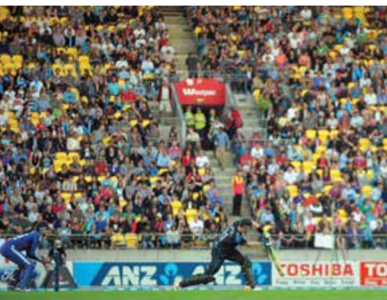
T20 CRICKET BLACK CAPS VS ENGLAND 15 February 2013