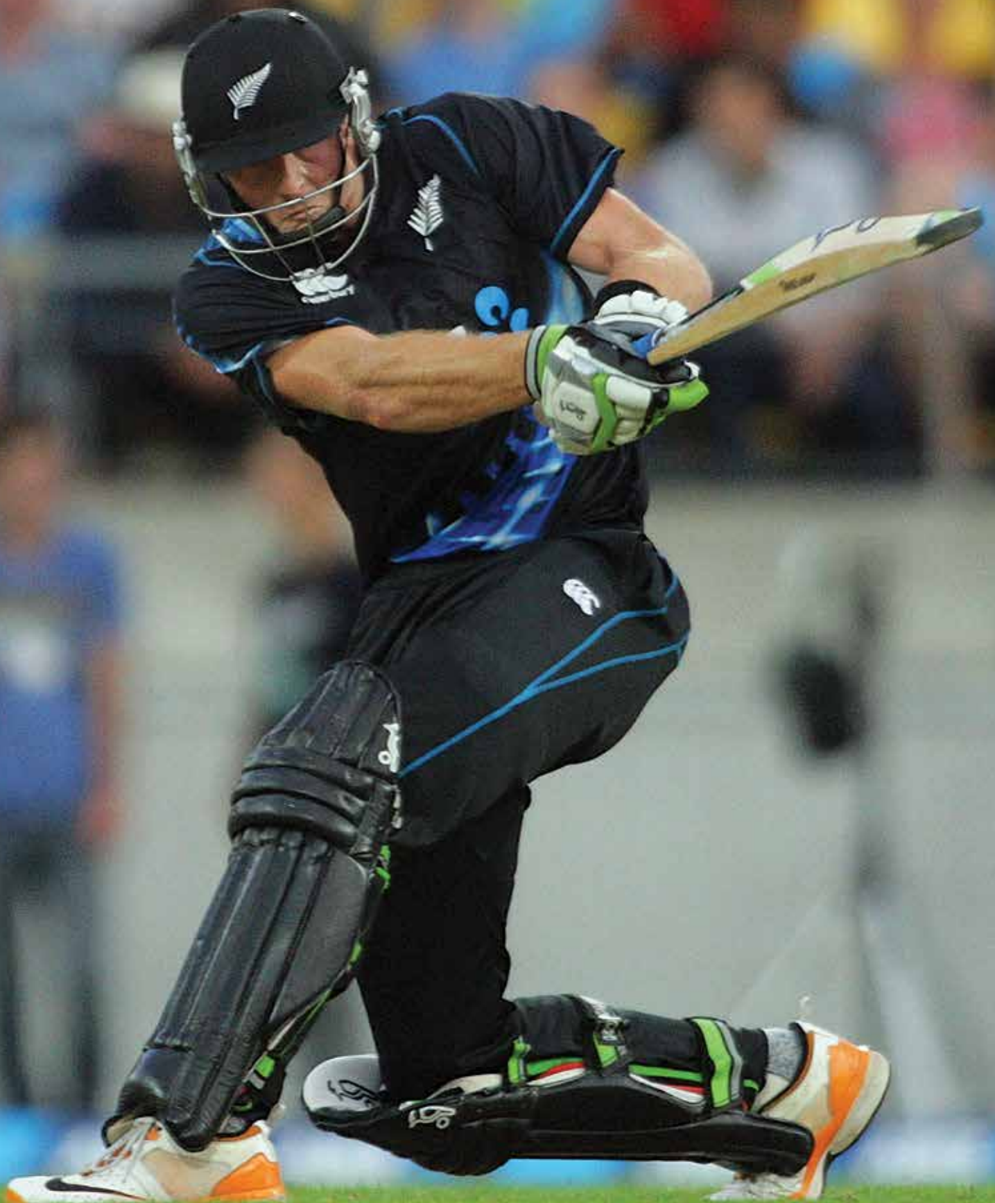
TWENTY20 BLACK CAPS VS ENGLAND 15 FEBRUARY 2013