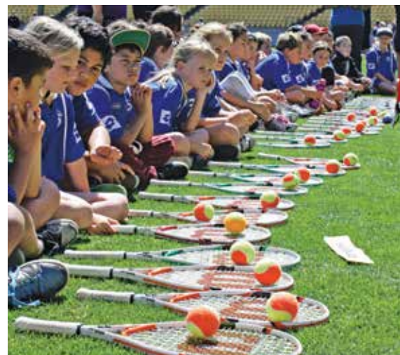
PELORUS TRUST STADIUM SPORTS FESTIVAL 12 March 2013