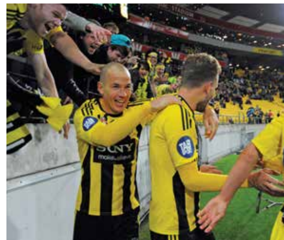
WELLINGTON PHOENIX VS SYDNEY FC 6 October 2012