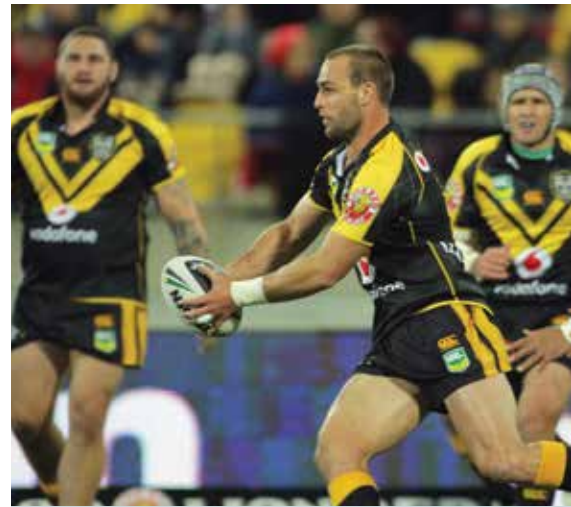
WARRIORS VS BULLDOGS 11 May 2013

As the manager of a community asset, the Trust tries to incorporate as many community events as possible each year. We were delighted to assist with NZ Fire Service training, Sport Wellington School Sports Day and NZ Army training. We were also delighted to host the Wellington Marathon, where for the first time 5,000 runners competed in the full marathon, half marathon, 10km and the Kids' Magic Mile.