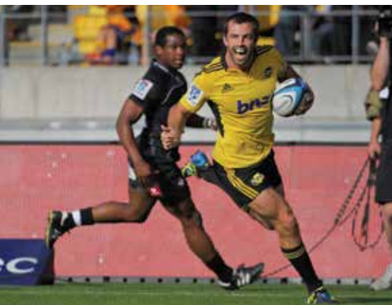
HURRICANES VS KINGS 30 March 2013

The Stadium also hosted two HRV Cup Twenty20 matches featuring the Wellington Firebirds.