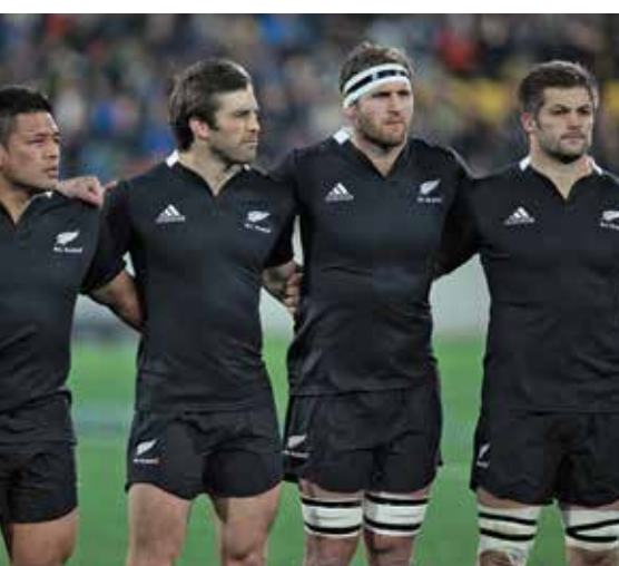
ALL BLACKS VS ARGENTINA 8 September 2012