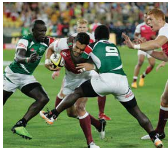
HERTZ SEVENS TOURNAMENT 1-2 February 2013