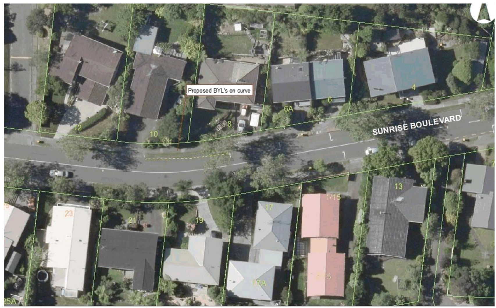
Sunrise Boulevard Tawa TR (70-14) Proposed No stopping at all times

MAP PRODUCED BY: Wellington City Council