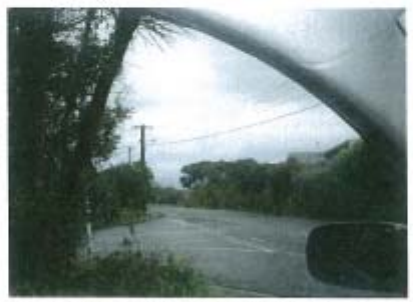
View showing sight line past tree to the left from drive way exit