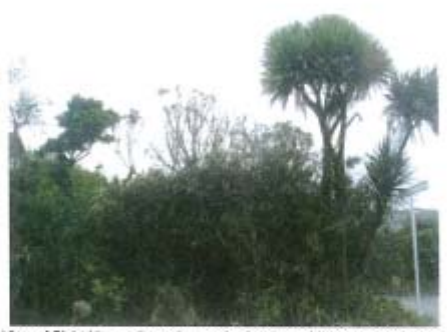
View of Sight Line - alternative angle showing cabbage tree and corner