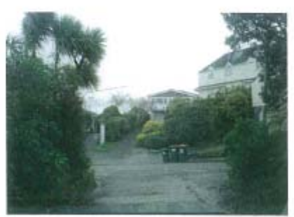
View as car approaches drive way exit

Although a driver might glimpse a car on Seatoun Heights Road approaching from the south through the Sight Line as you suggest, the driver will be required to pause where the drive way meets the road to carefully check for traffic coming from the right or along Townsend Road to the left, as well as pedestrians. The visual check through the Sight Line would not appear to be a reliable indication of what traffic might be approaching the intersection without also pausing at the exit of the drive way to check traffic coming from other directions. Once these checks are complete, a driver must also check for any traffic turning right out of the intersection before safely exiting the drive way (which is made possible given the clear view of the intersection from the end of the drive way as pictured below right). The Sight Line does not appear to offer any additional visibility when exiting the drive way.