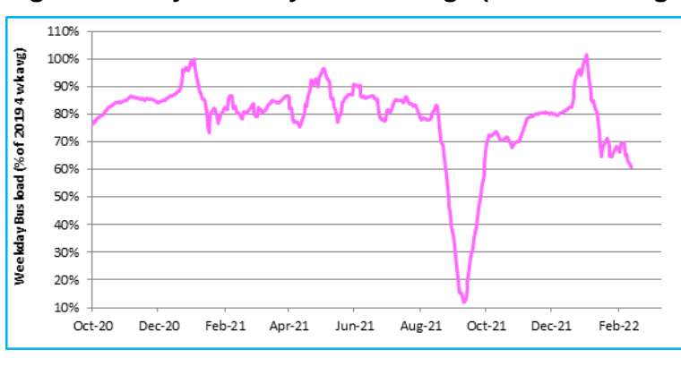
Figure 2: Daily weekday bus loadings (4-week average)

Figure 2 present bus loading which we tend to use as a proxy for working from home: