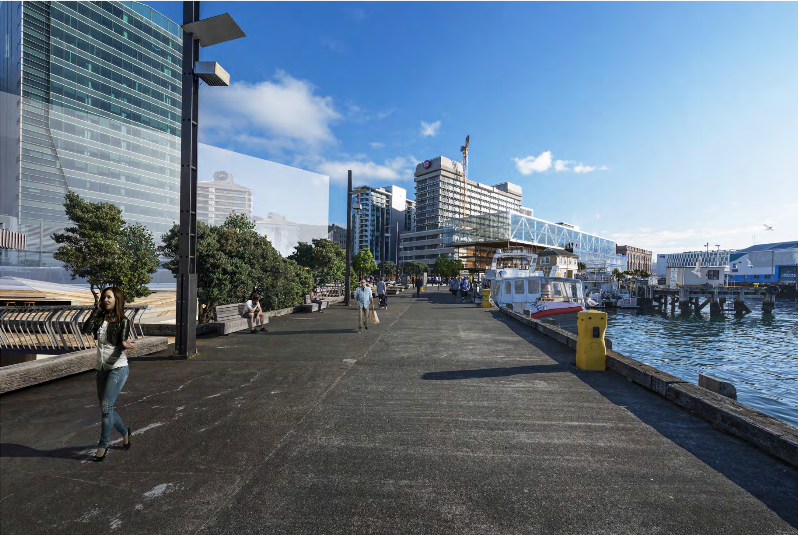
Artist Impression of Proposed Design