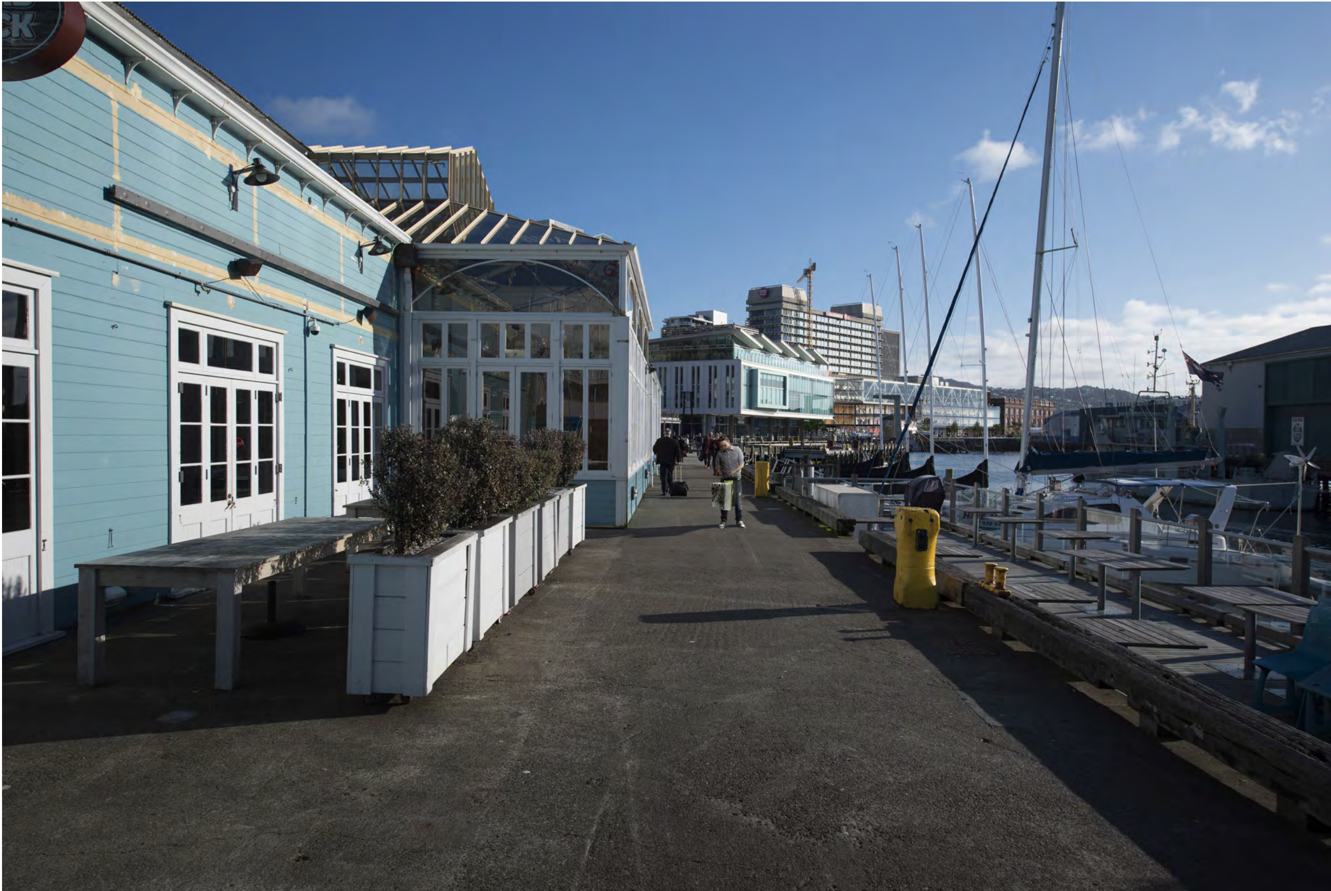
Artist Impression of Proposed Design