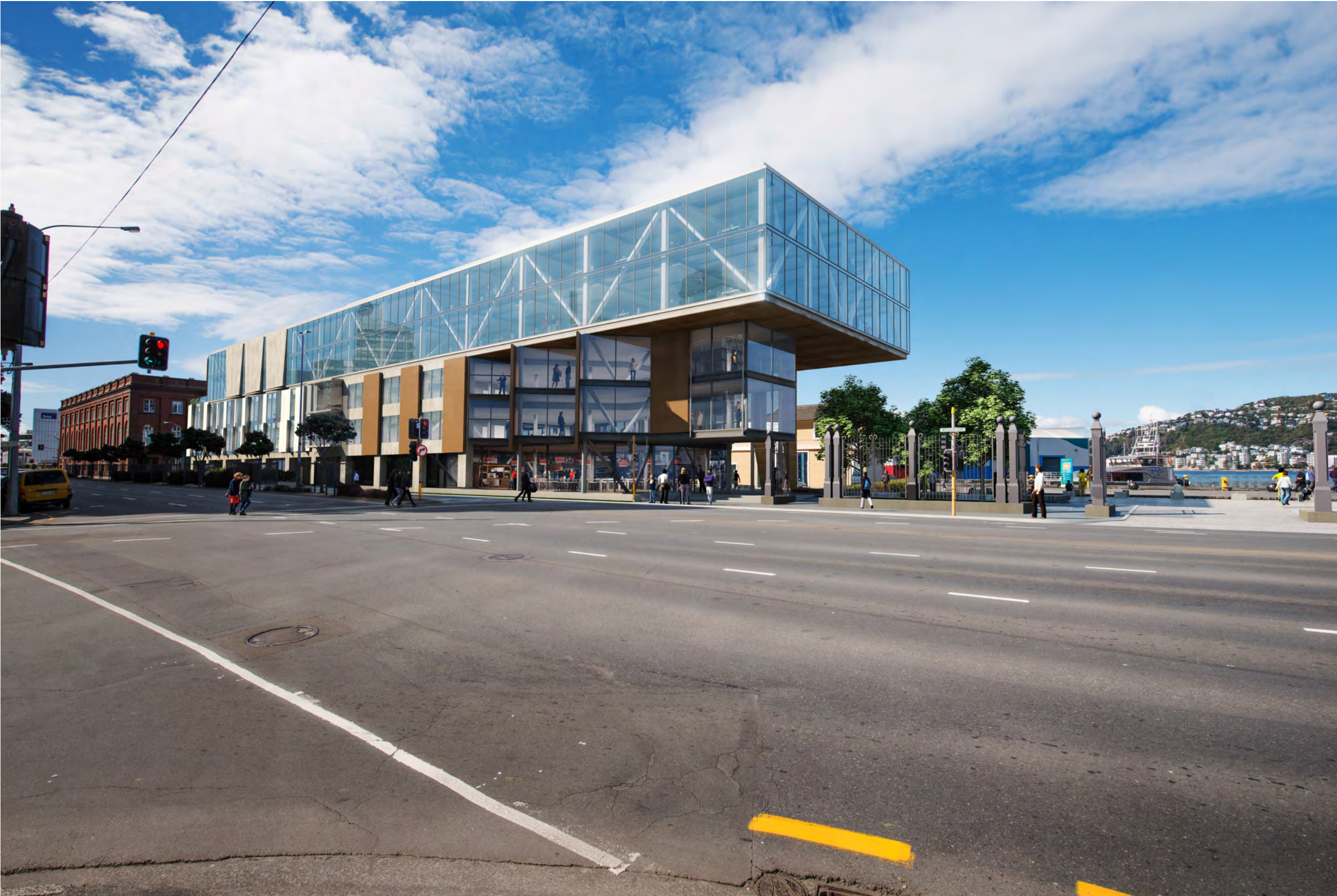
Artist Impression of Proposed Design