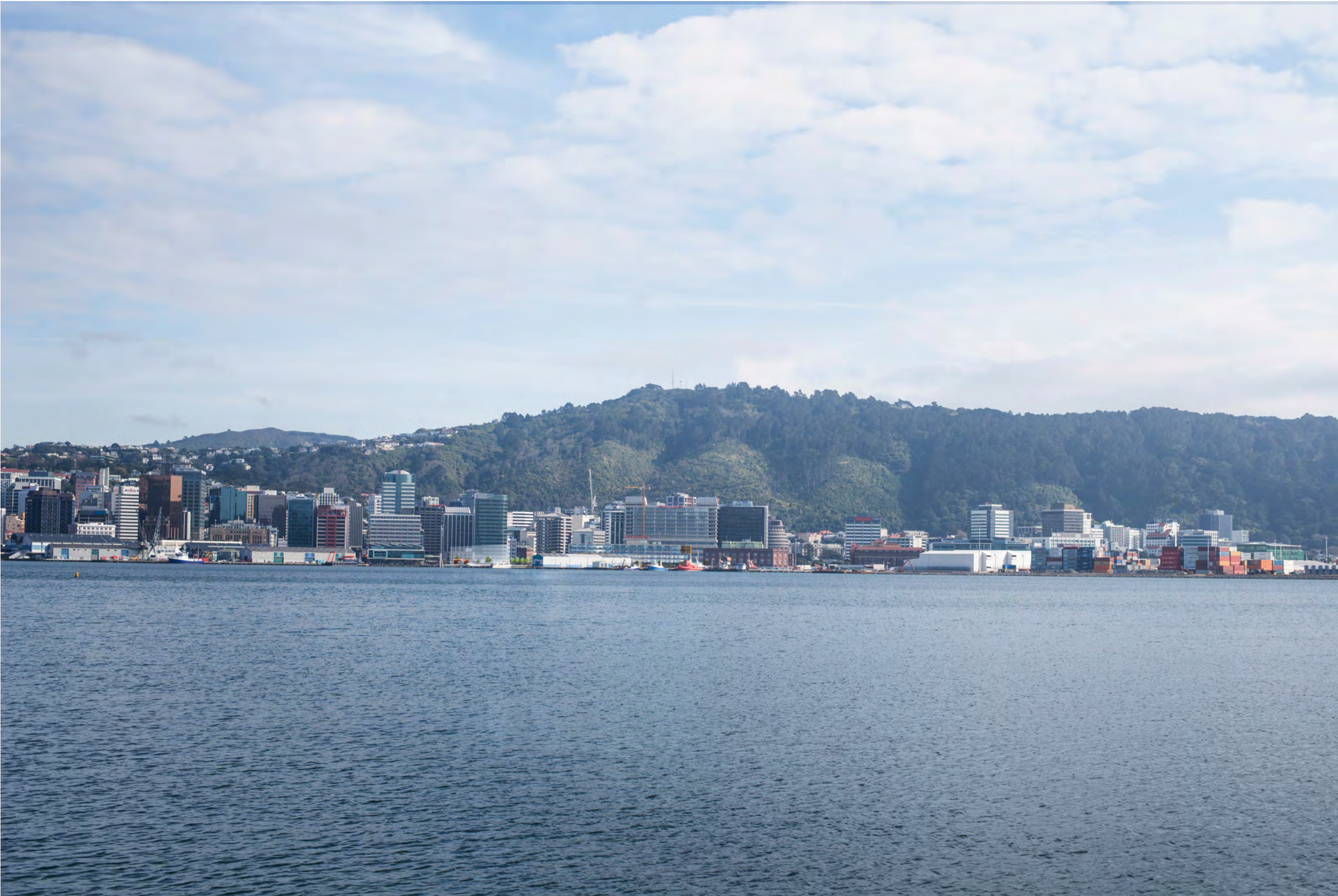
Artist Impression of Proposed Design