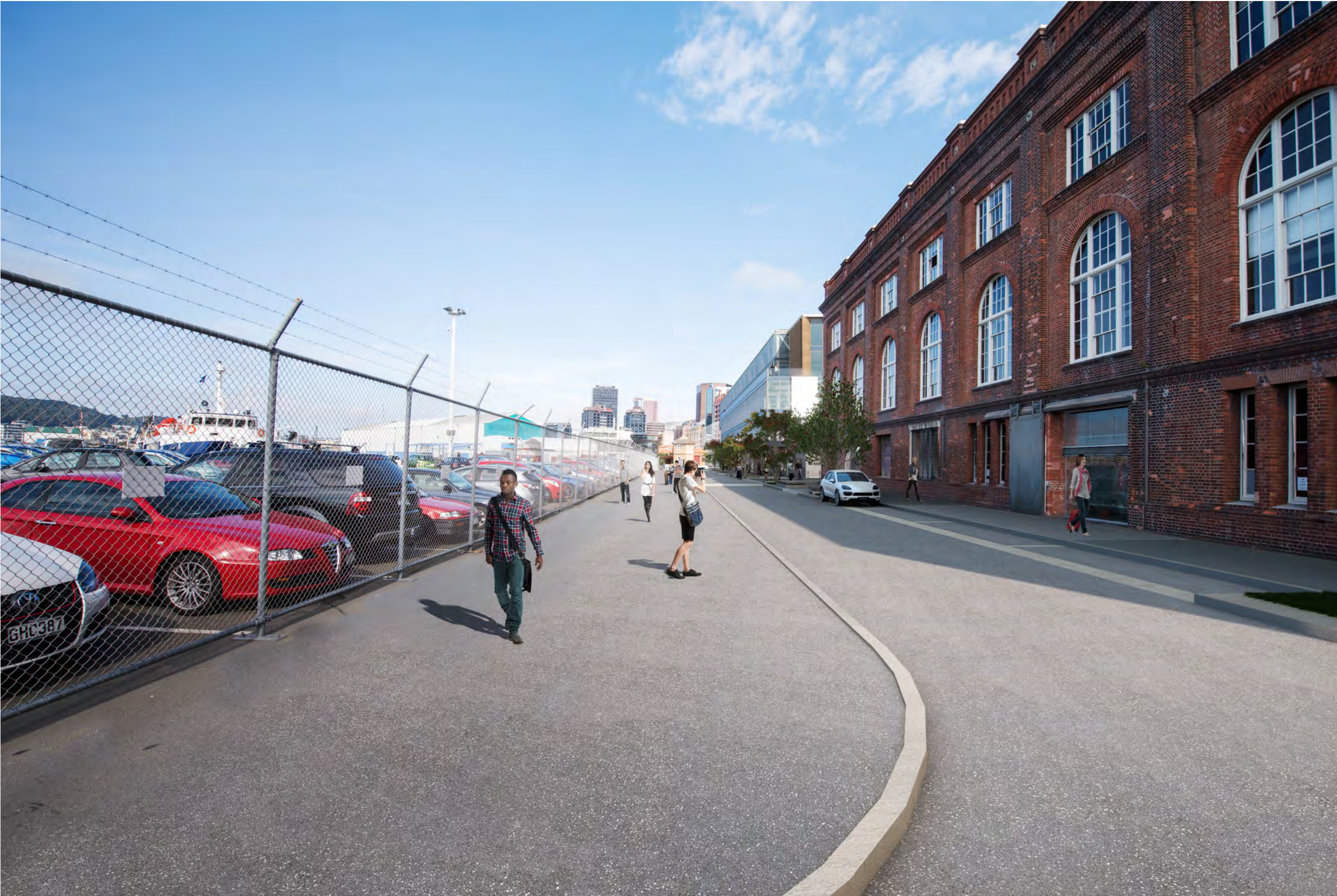
Artist Impression of Proposed Design