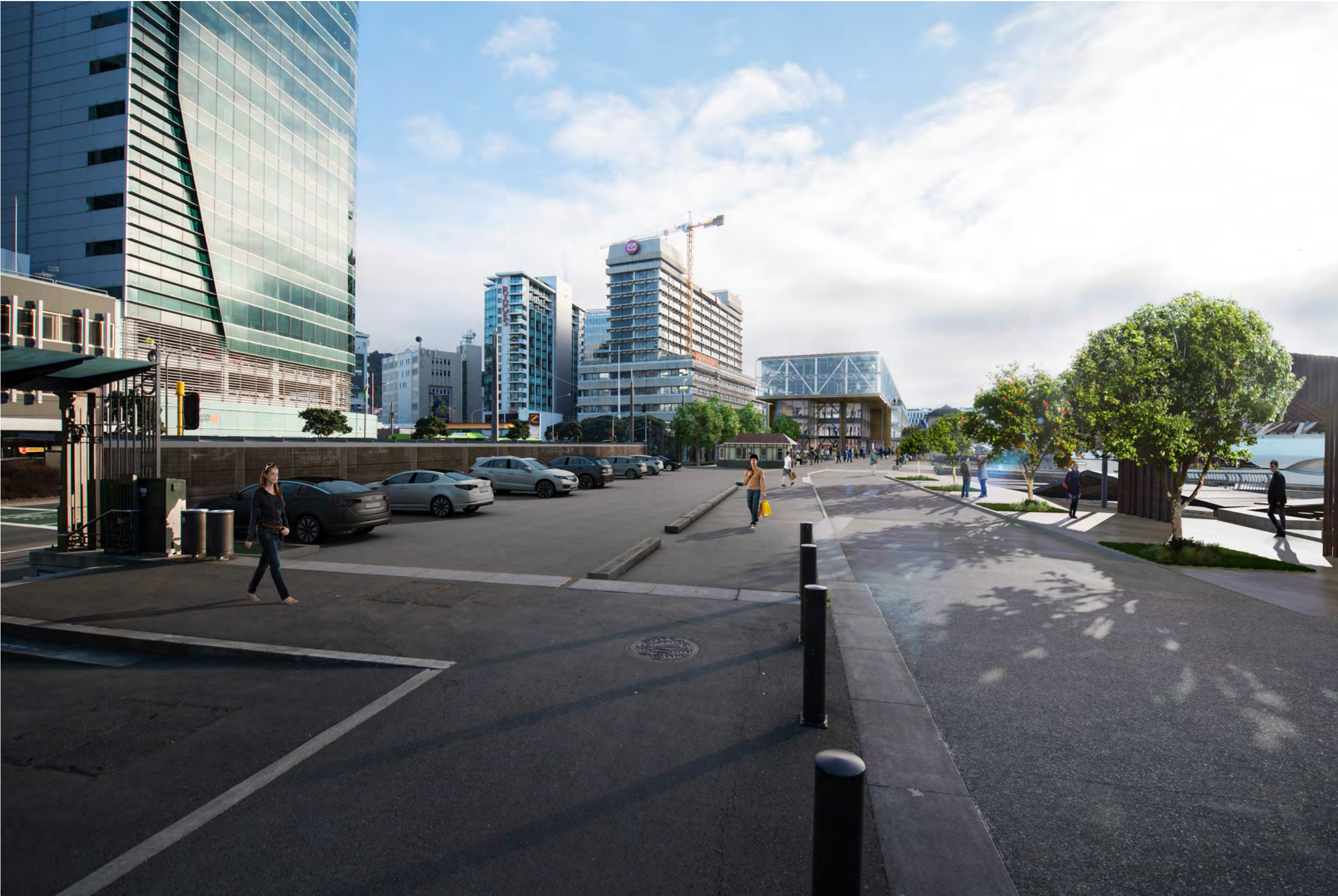
Artist Impression of Proposed Design