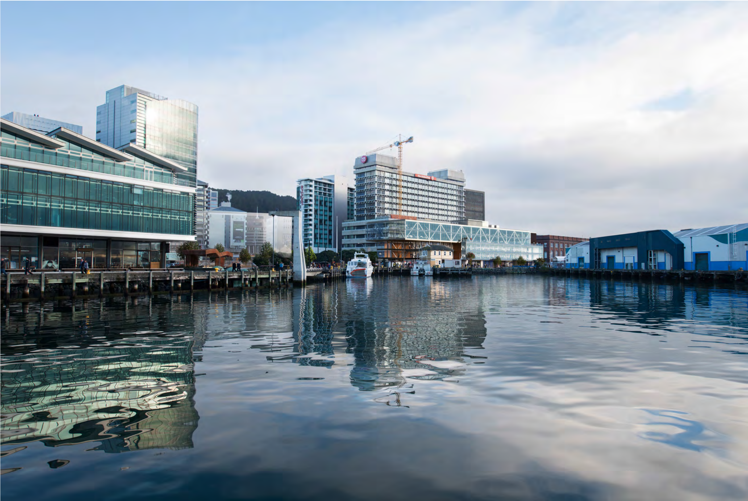
Artist Impression of Proposed Design