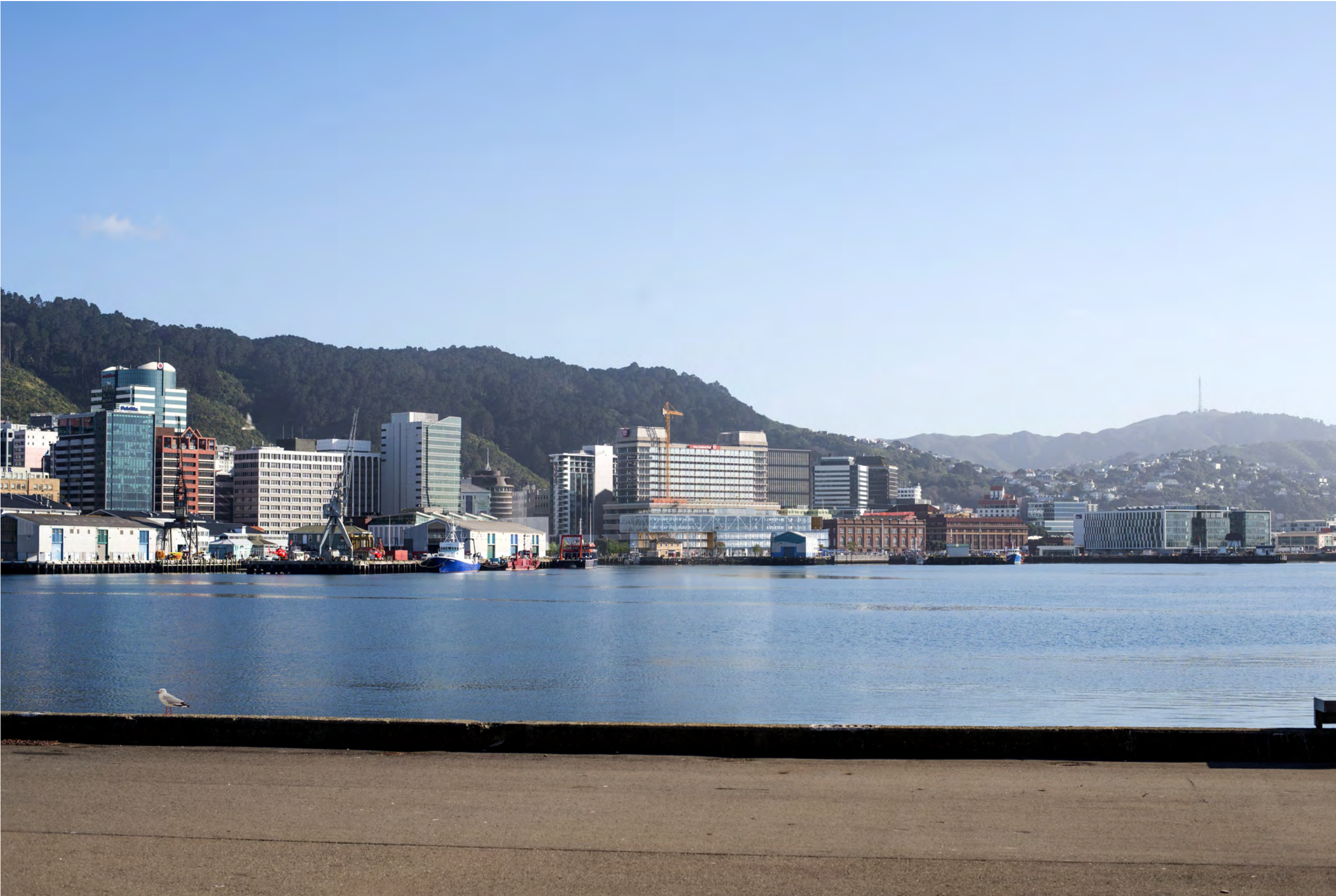
Artist Impression of Proposed Design