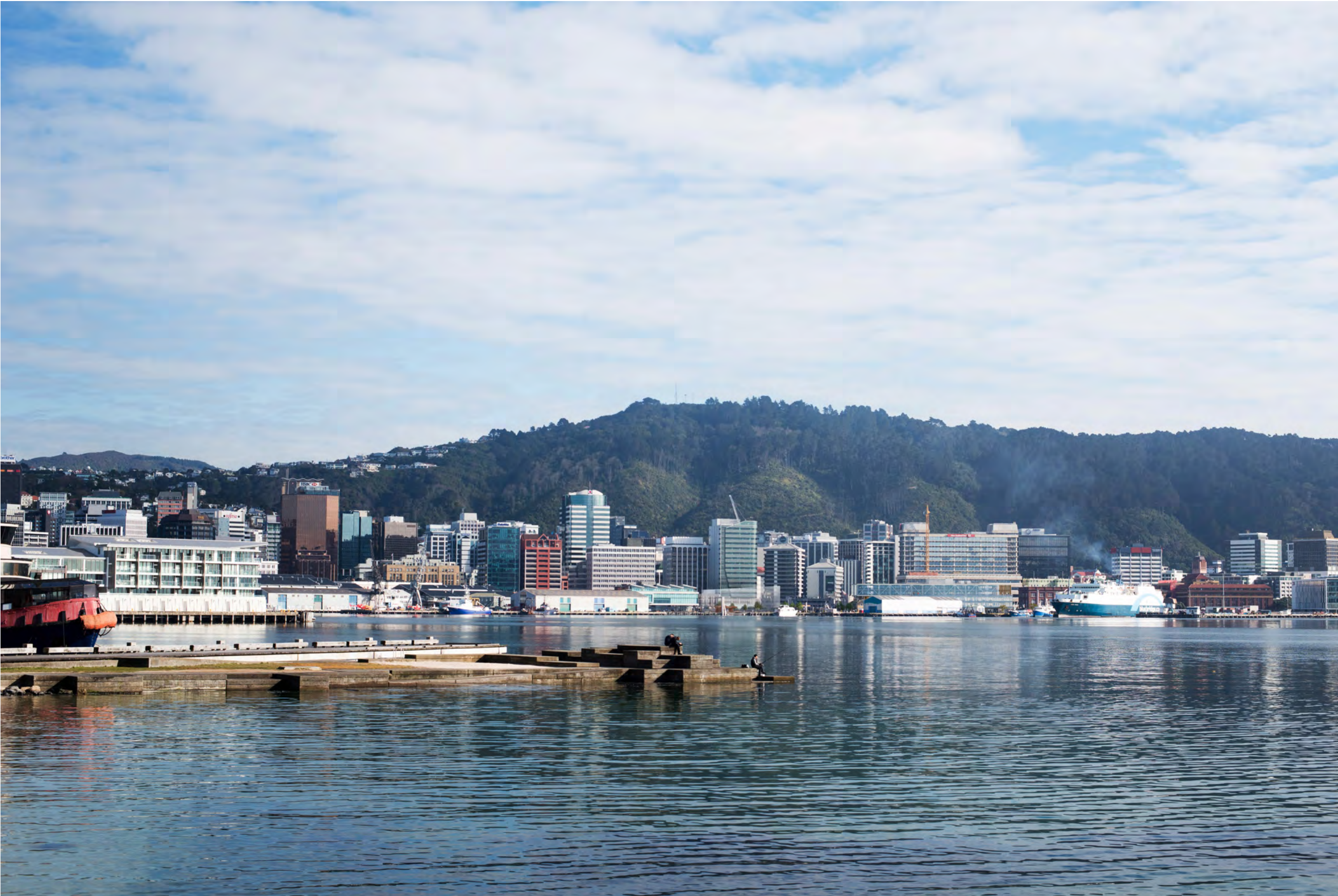
Artist Impression of Proposed Design