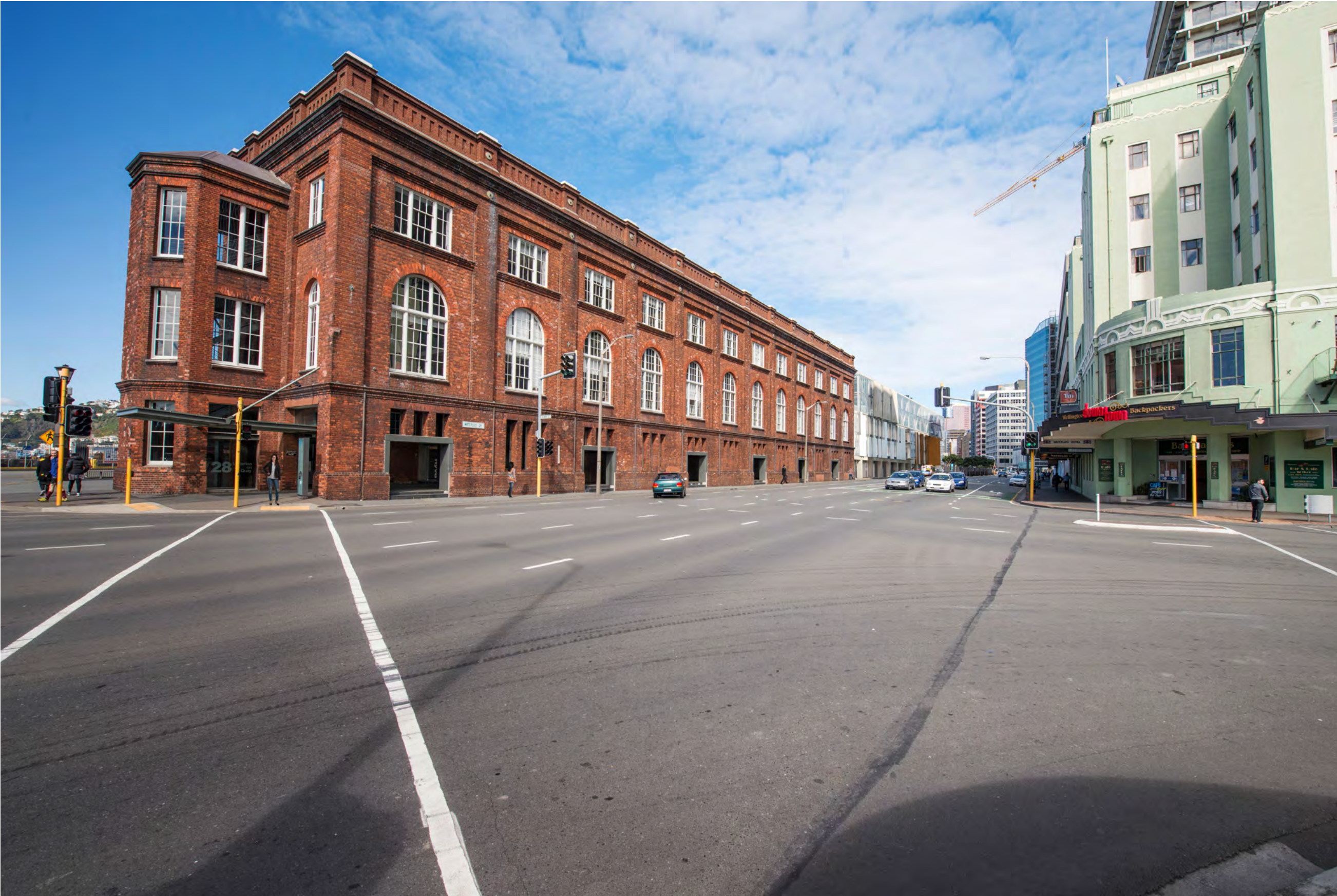
Artist Impression of Proposed Design