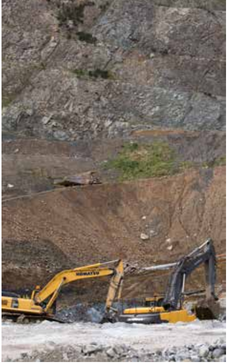
Quarry operations in 2017