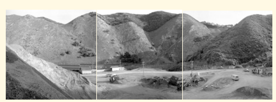
Panorama of Kiwi Point Quarry 1964

Kiwi Point Quarry in Ngauranga Gorge has existed since the 1920s, with rock extraction taking place since the 1880s. It is the last remaining quarry in Wellington City and is owned by Wellington City Council.