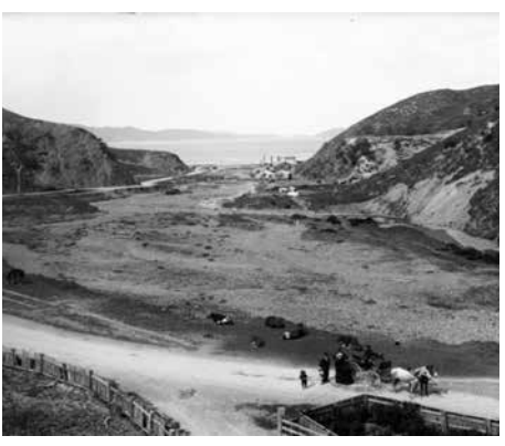
Ngauranga Gorge looking south to Wellington Harbour c1880