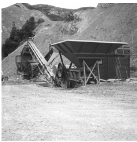
New crusher in 1967