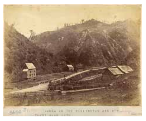
Ngauranga on the Wellington Coast Road 1870